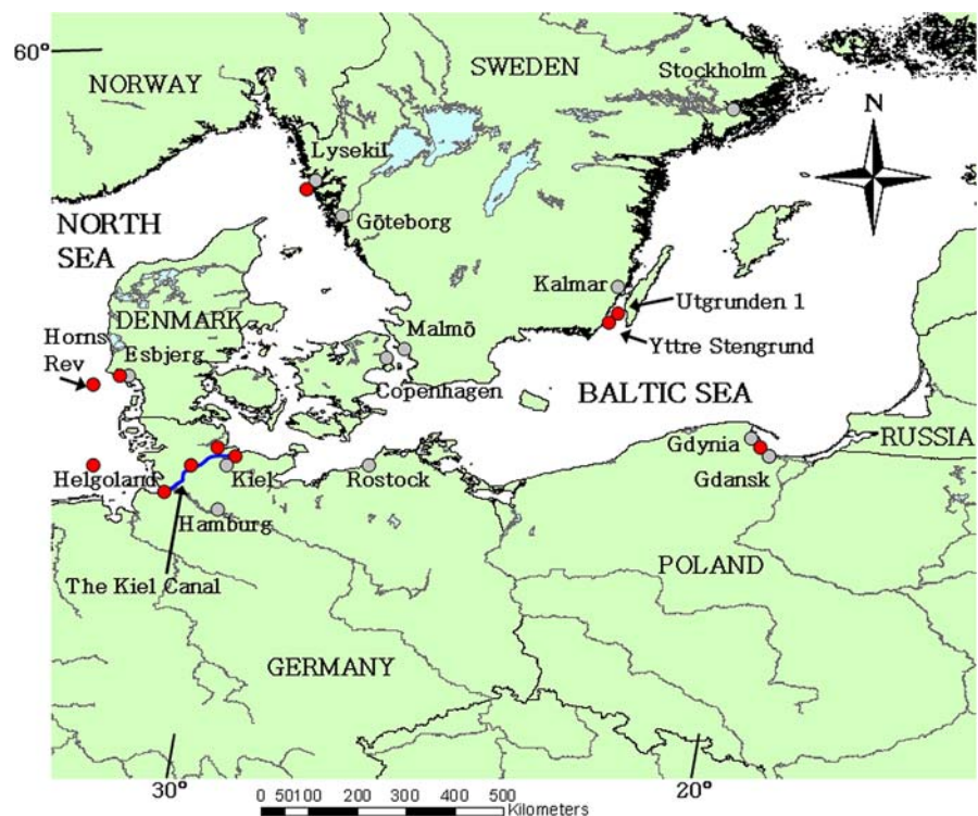
Fig. 1 Findings (dark/red circles) of Telmatogeton japonicus in the southern Baltic Sea and the adjacent part of the North Sea (Atlantic Ocean). The present study was done at Utgrunden 1. Important ports for shipping near the findings are indicated as light grey circles

While working within the project DOWNWInD ( Distant Offshore Windfarms with No Visual Impact in Deepwater ) surveying the fish community around the seven offshore windmills at the wind farm Utgrunden 1 in the southern Kalmar Strait of the Baltic Sea (Fig. 1), observations were made by M. H. Andersson in August 2007 of a frequent occurrence of a dark midge on the windmill foundations in the splash zone (Fig. 2). When returning in October the same year, three samples of the adult midge were recovered by a SCUBA diver swimming in the surface water using a small landing net. Several larvae and pupae of the midge were sampled from the splash zone (the water surface and 50 cm upwards) by the collector standing on a ladder connected to the wind turbine foundation, and samples were taken using a knife and tweezers. All organisms were stored in 70% alcohol for transportation and analysis. At the wind farm Yttre Stengrund 30 km south of Utgrunden (cf. Fig. 1), visual observations of larvae and flying adults of