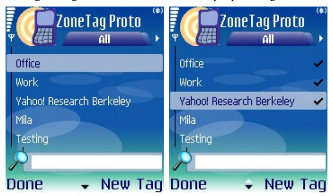
Figure 2. Users can choose to add tags to the photo before it is uploaded. A list of suggested tags is shown (left), and the user can select them (right) or type in new tags.

with the image. The controls include the option to set the image privacy settings: following the Flickr model a photo can be completely private; viewable only to Flickr users marked as 'friends' or 'family' by the photo owner; or public. The user has the option to specify a title for the photo, which appears on the Flickr photo page. Finally, the user can choose whether to expose the photo's location data. If she chooses to include location data, the zip code and city names are added as tags to the photo's page on Flickr. Most importantly, the user has an option to select or type in tags (textual labels) to appear on the Flickr photo page. Tags on Flickr are used for personal organization and public sharing; both generate incentives for some people to tag.