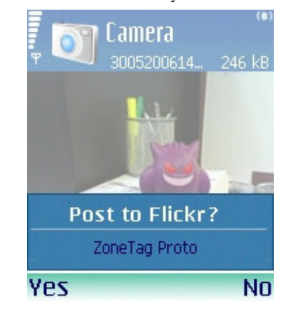
Figure 1. When a photo is taken, a dialog pops up asking the user whether they would like to upload the photo to Flickr.

capture is a promising step towards lowering the barrier to participation in a media annotation system.