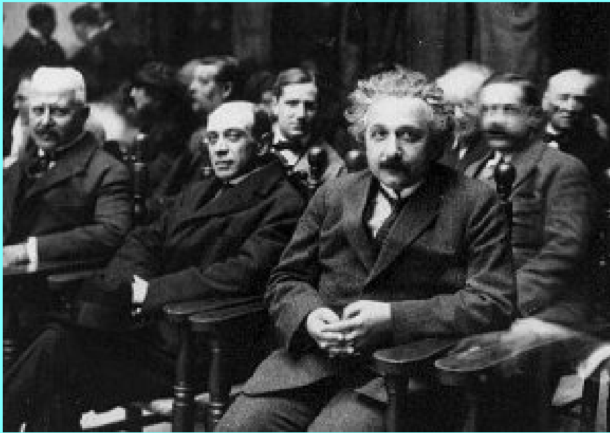
Albert Einstein Barcelona, 1923