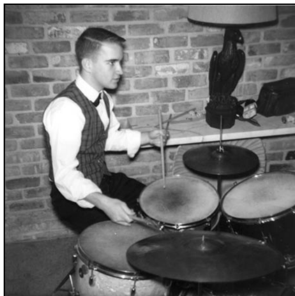
The Capers’ rockin’ drummer.