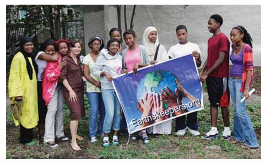
Members of The Earth's Keepers Community Gardeners of West Philadelphia.