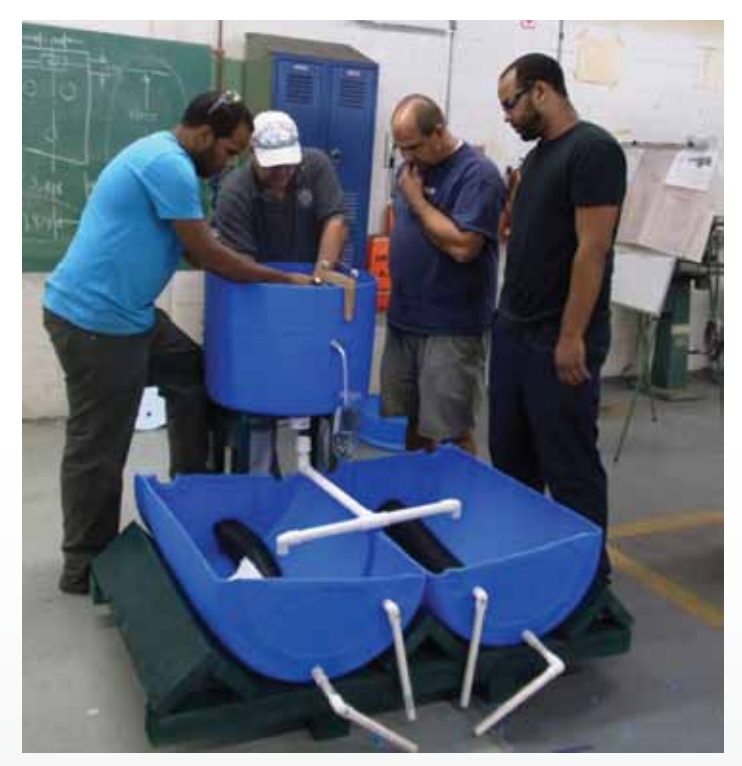
Members of the LCGD assemble their homemade aquaponics system.