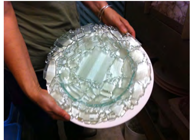
Glass plate made from the Muni broken glass.

Following the work of one artist in residence, Reddy Lieb, the program has continued to make beautiful glass bowls.