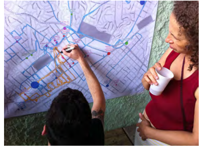
Researchers and cooperative members fill in details on the map of a manual picker's walking route. A public workshop at the end of the experiment allowed the whole cooperative and members of the community to respond to and augment the collected geographic data.

In the first part, each waste collector carried a small GPS logger on his or her daily route. At the end of the day, we conducted interviews with the collectors in which they used a laptop to see their collection paths traced on a map. We