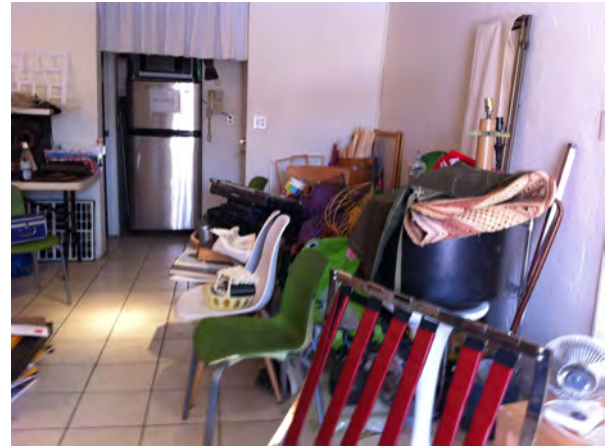
Materials recovered from the dump.