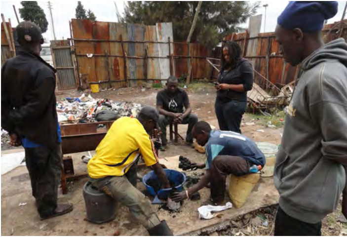
Making charcoal briquettes from organic waste in Kibera.