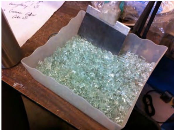
Broken glass from Muni bus shelter.

bles, and in total offers about 20 different ways to get rid of what most consider trash. Through working closely with the city of San Francisco, Recology has helped the city reach a nation-leading 77% diversion from landfill in 2010. The Artist in Residence program is one more way that Recology is pioneering new programs in the resource recovery industry. Resource recovery differs from waste management because it approaches the waste stream as resources that can be separated and recovered instead of being collected and buried or burned.