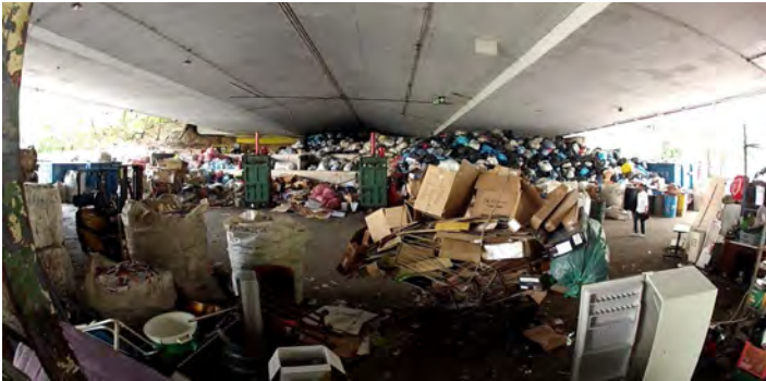
The recycling cooperative Coopamare, underneath a road overpass near central São Paulo.

Traditional managerial wisdom offers little benefit to their bottom-up systems. Yet, the catadores know many things about the city; they read and navigate the city differently from