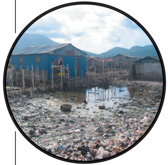
One of the poorer neighborhoods in Petite Anse, Haiti.