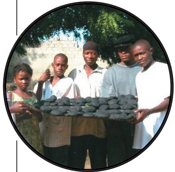
Students of the “Ecole de Charbon”