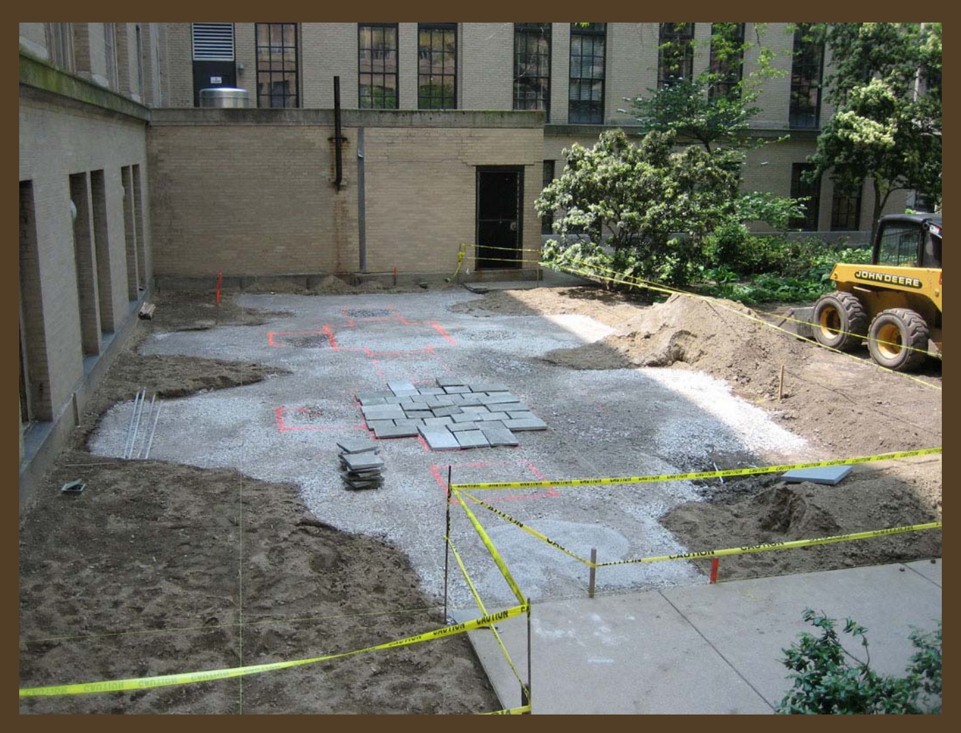
Recycled bluestone pavers from demolished Dibner Garden