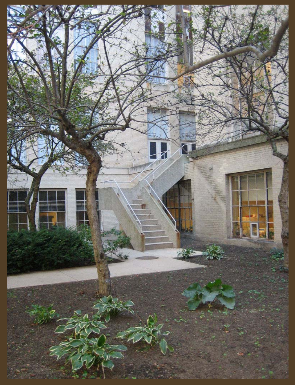
Existing Crabtrees and Hostas