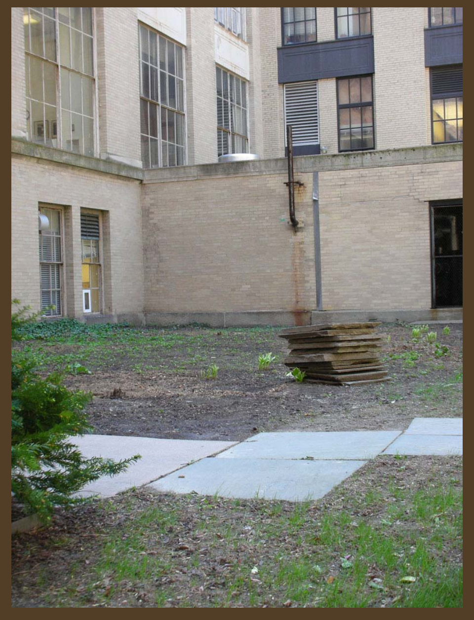
Grounds removed the Crabapples