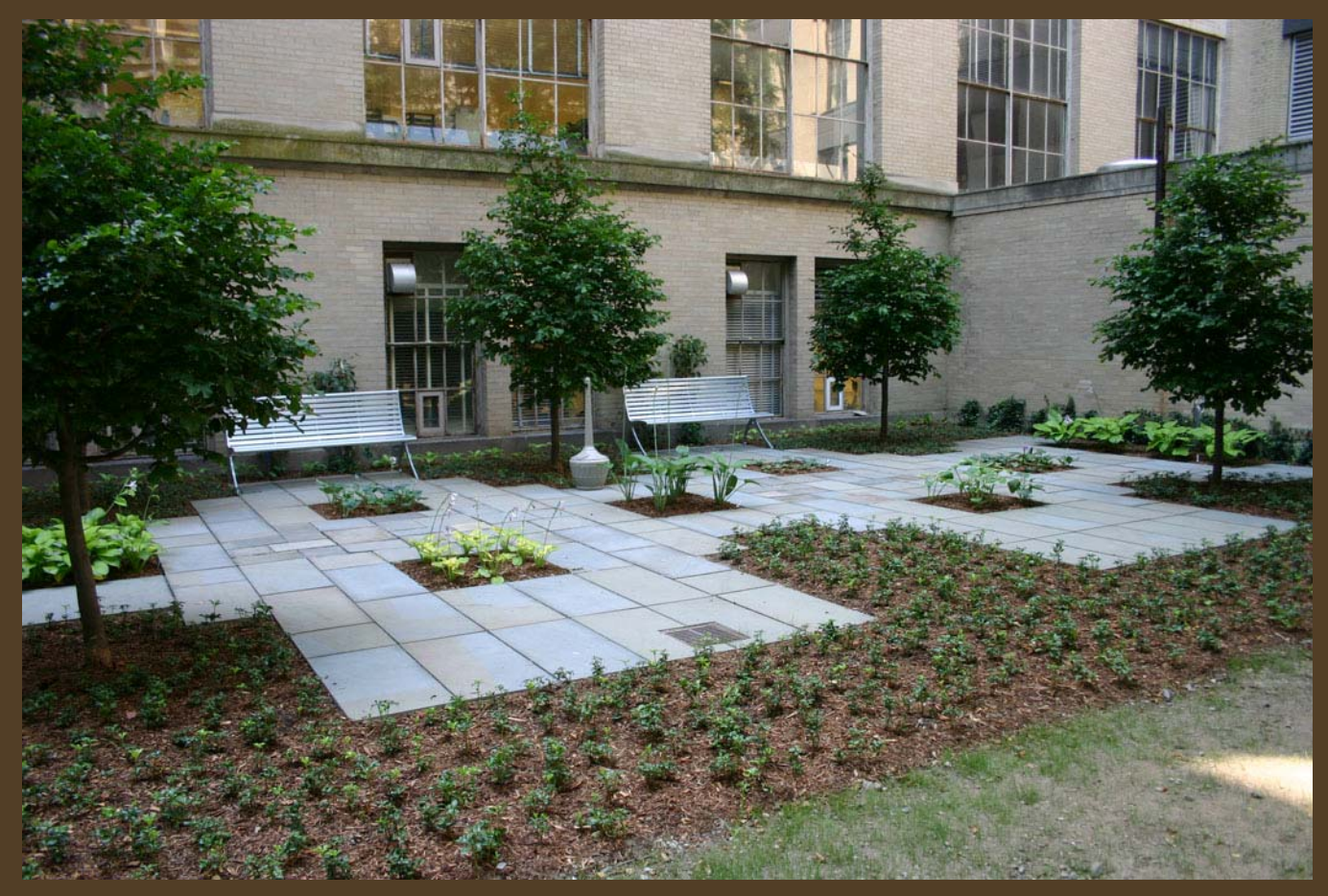
The garden is complete