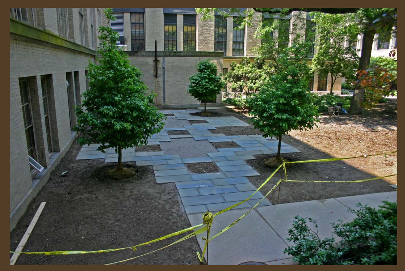
Bluestone patio and openings for Hosta islands