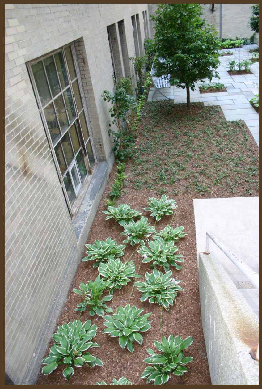
Existing Hostas and other new plants