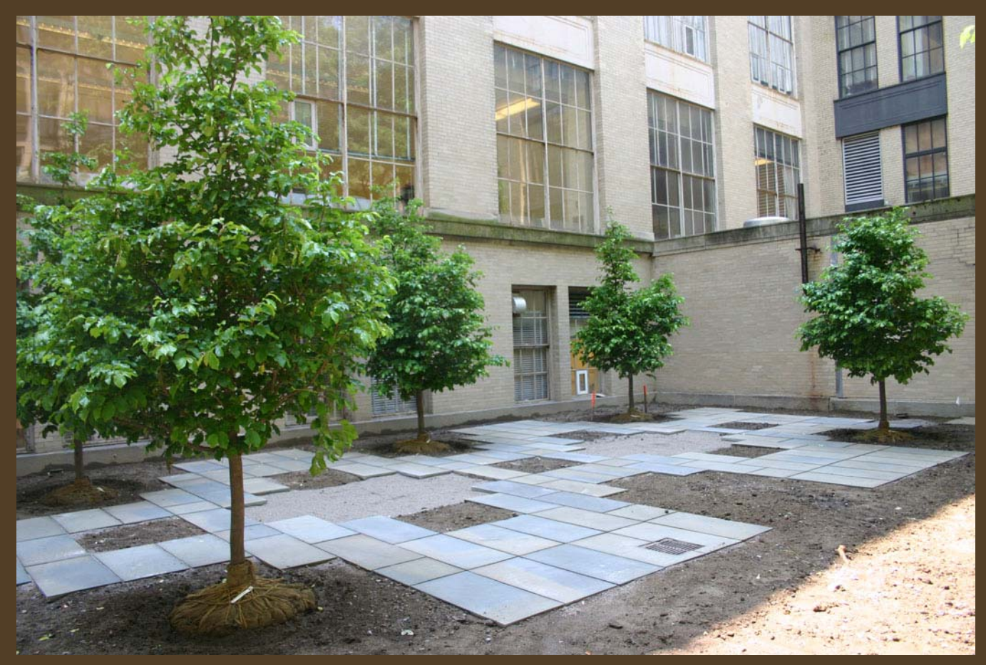
New trees – Parrotia persica