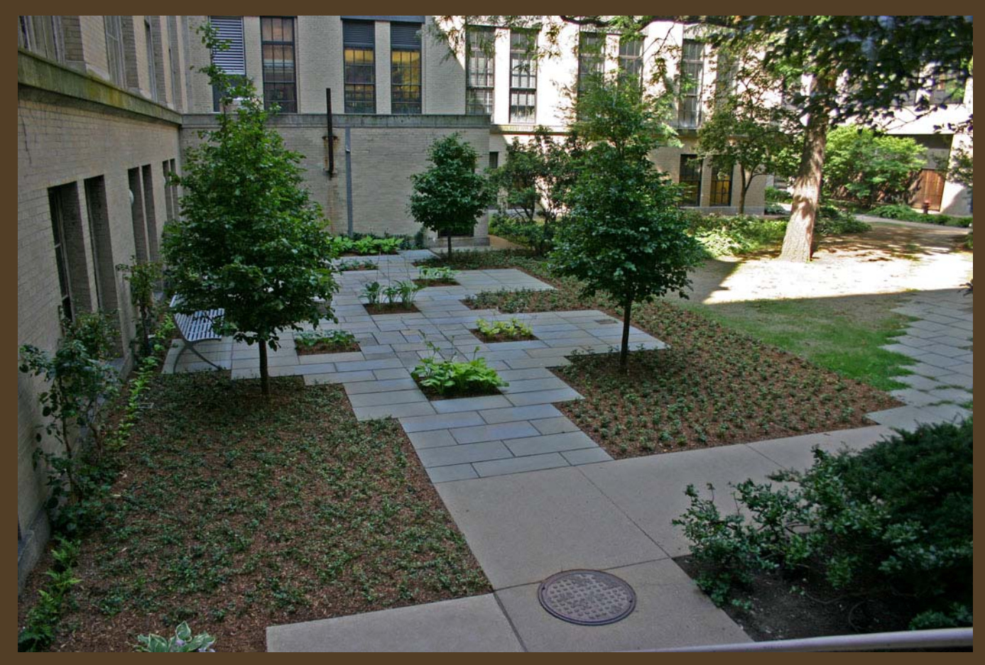
All the plants are in, including donated hostas