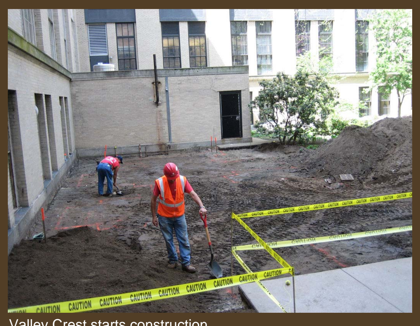
Valley Crest starts construction