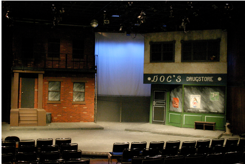
The West Side Story set