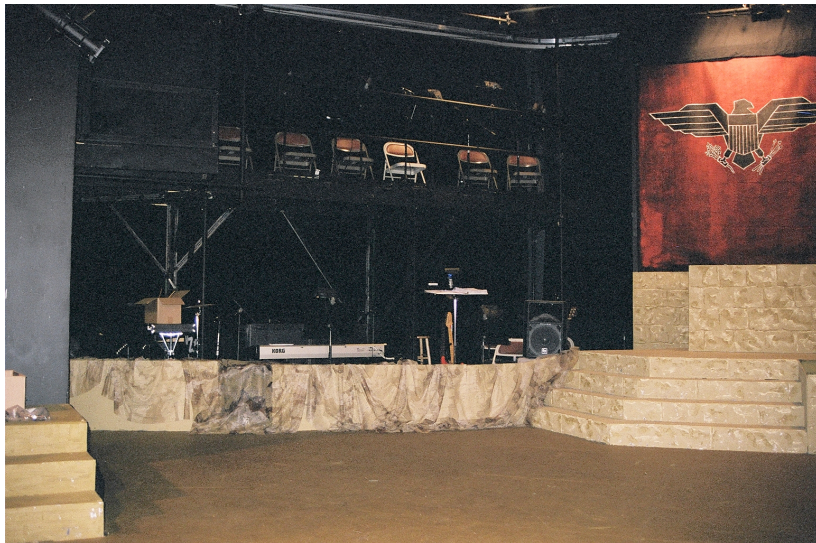
The second left side is suspended to allow actors to pass below