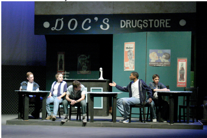
Doc's Drugstore open for business