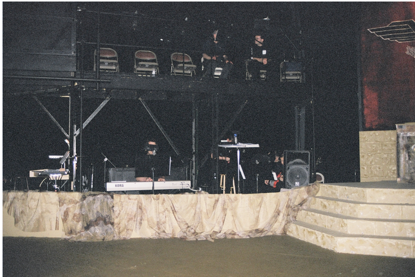
The JCS two-story orchestra