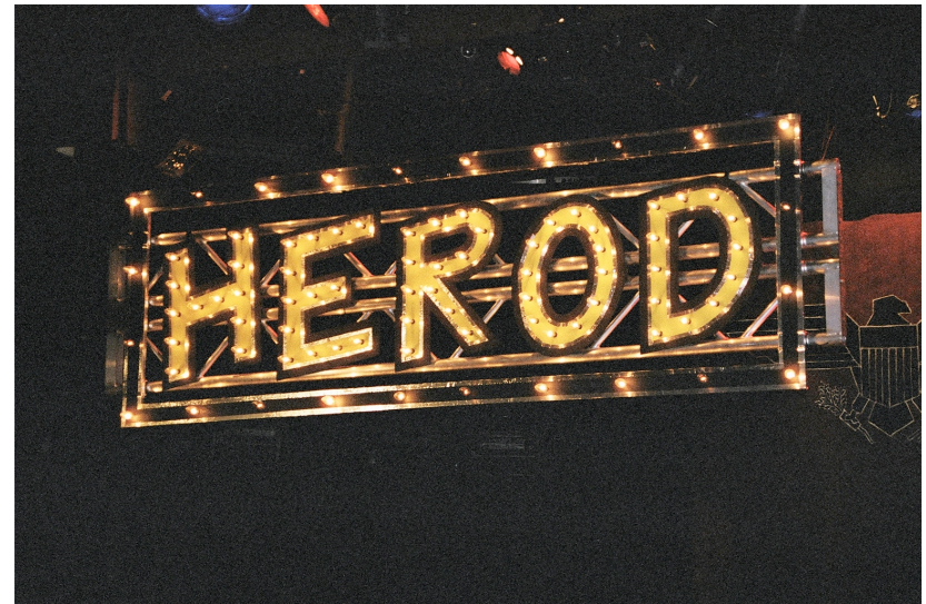
Each letter could be controlled separately while the border had three separate circuits for chase effects