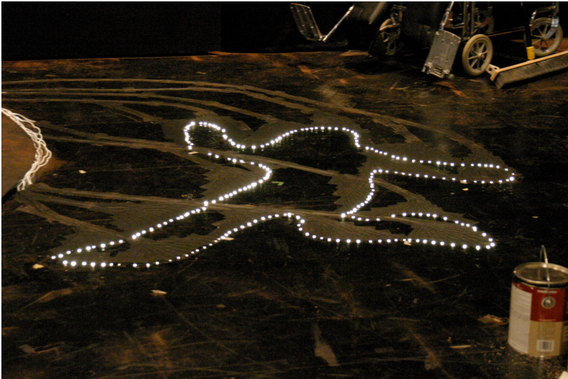
The “body outline” for Tommy is nearly completed, before painting over the fiber trails (routed into the floor surface) and masking the strands traveling off-stage