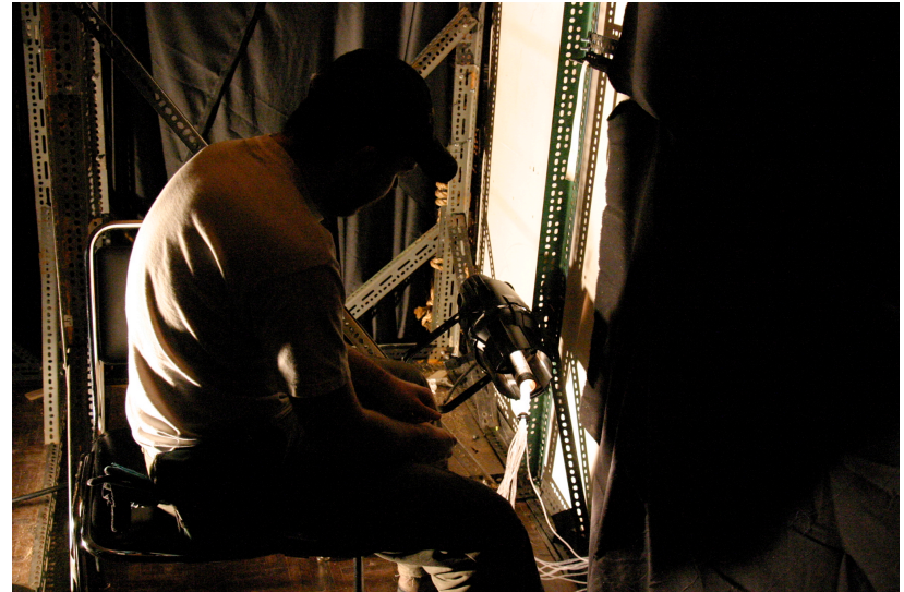
Fiber strands travel offstage to the light source: a standard theatrical lighting instrument “coupled” to the fiber strands with cheap, available hardware and ingenuity.

West Side Story photos courtesy of Jax Kirtley Jesus Christ Superstar photos and Tommy photos courtesy of Jenn Braun