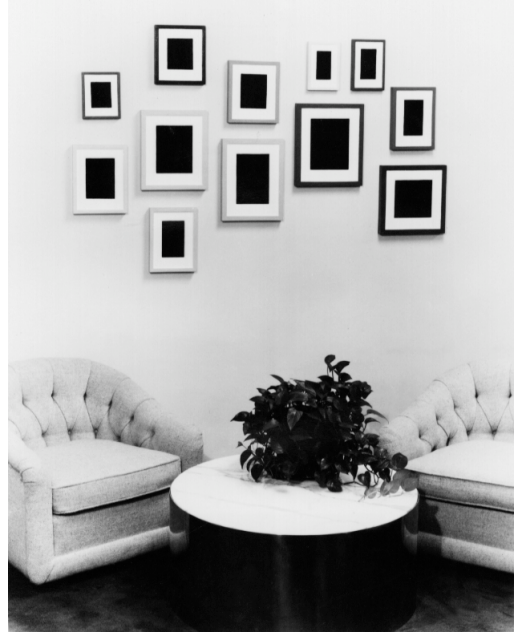
Allan McCollum. Surrogate Paintings. 1980/81

The terms of deception that surround Allan McCollum's Plaster Surrogate paintings - the work for which he is best known - can themselves be deceptive. There is, of course, nothing false about the objects themselves. (How can objects be false? Only subjects deceive and are deceived.) McCollum doesn't employ illusionism or trompe l'oeil. His surrogates aren't forgeries of paintings. They're not even paintings – only plaster objects, which may, at a distance, resemble framed images. If the art objects that McCollum produces present themselves as false, it is only because they are the products of a false artistic practice, a practice reduced to a going through the motions of artistic production. Similarly, the terms of reduction that surround McCollum's work can themselves be reductive. There is, Of course, nothing missing, nothing lacking in the objects