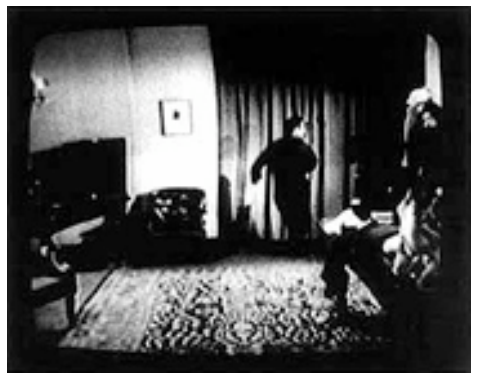
Allan McCollum. Source for Perpetual Photo No. 10 , 1982. Photo from TV.

on experience - the "creative" aspects of work denied in the standardization and mechanization of the labor process but nevertheless necessary for the efficient and profitable functioning of industry. Instead of accepting the superficial freedom and petty transgression of rules allowed by management, workers transform a strict adherence to factory regulations into a much more threatening transgression: collectively refusing freely, willingly, to invest their labor in work to the profit of their employers.