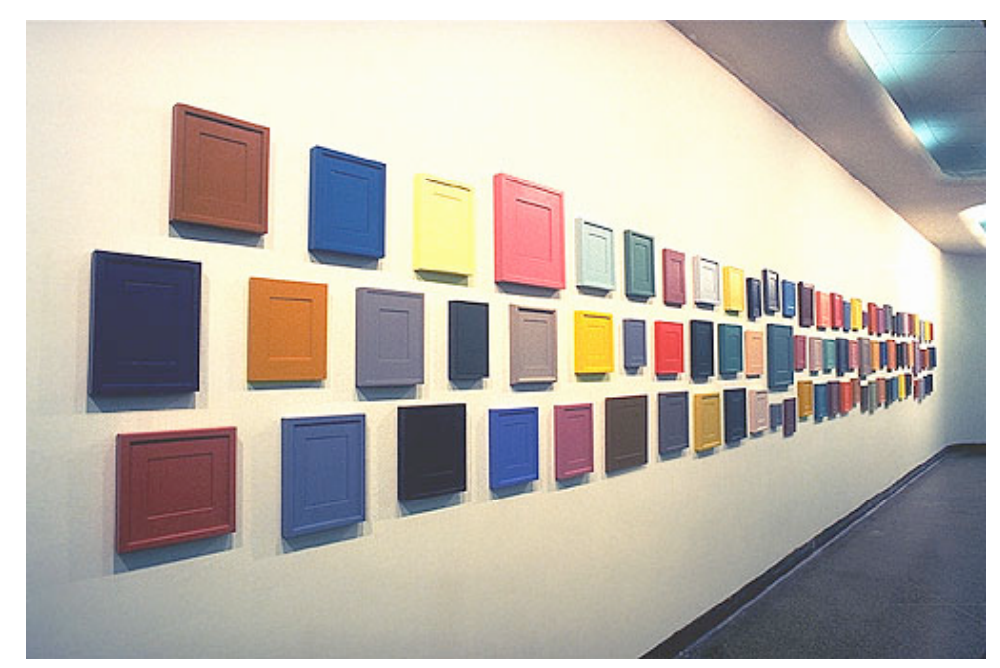
Allan McCollum. Surrogate Paintings, 1978-79. Acrylics and enamels on wood and museum board. Installation: 112 Workshop, New York City, 1979.

In a show in 1979, I put eighty of these "Surrogate Paintings" together in a cluster. It was hard to deny that there was something a little off about these works: they weren't exactly paintings, they were objects that represented paintings. I decided that maybe if I started giving them a black center, and articulating the frame with a slightly different color, I might make it more explicit that they weren't little Minimalist sculptures but signs representing paintings. One prob-