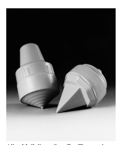
Allan McCollum. Over Ten Thousand Individual Works (detail). 1987-88. Enamel on cast Hydrocal, 2" diameter each, lengths variable.

In 1987 I began a series called "Individual Works," which addressed the notion of the unique versus the mass produced object probably more than any other series did. I