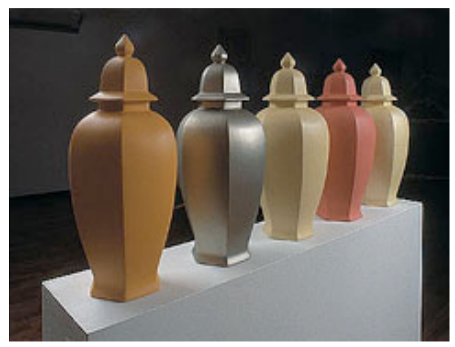
Allan McCollum. Perfect Vehicles .1985. Acrylic paints on cast Hydrocal. 19 x 9 x 81/2 inches each.

up with a technical solution: I twenty of the "Surrogate Paintings," made molds from them, and began to cast them in plaster. Once I started doing that, I was able to make a lot more of them in less time-it had taken days to make them out of wood. So I was able produce larger, more dramatic installations, and also to solve the question