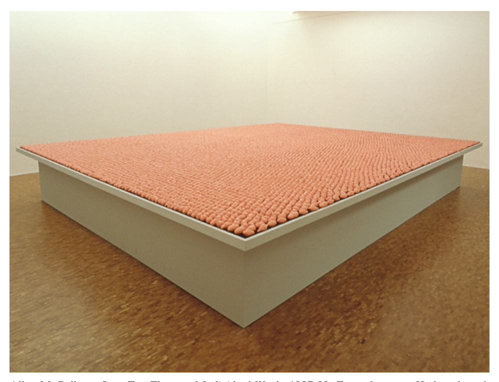
Allan McCollum. Over Ten Thousand Individual Works 1987-89. Enamel on cast Hydrocal, each object unique, 2" in diameter each, lengths variable. Installation: Musée d'art moderne Lille Métropole, Villeneuve d'Ascq, France. Collection of Kunstmuseum Wolfsburg, Germany.

We have a hard time coming to terms with huge numbers. When we think of a huge number of objects, it's comforting to imagine that they're all alike. But to imagine a huge number as all different—to think of a people we're at war with, for instance, as all unique individuals—is painful. To make distinctions among huge quantities of things we've been thinking are the same, to suddenly have to look at them as unique this is a painful disruption of our way of perceiving the world. So having all the objects in "Individual Works" in front of us makes us go through this battle. There are over 10,000 unique objects here—does it matter that they're unique? Are they symbolic of the world as a whole, because all people are unique? Or would I prefer to think of people as not unique? This series triggered a lot of that kind of moral consternation.