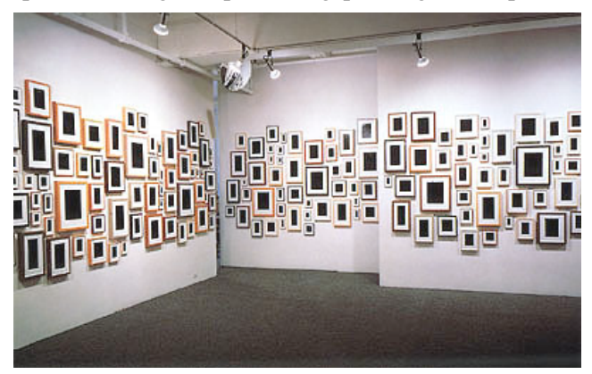
Allan McCollum. Plaster Surrogates . 1982/83. Enamel on cast Hydrostone. Installation: Marian Goodman Gallery, 1983.

lem I had during this period was getting people to recognize that the frame and mat were parts of the work. It was almost impossible for people to understand that; they would point to the center and say, "Oh, this is the work here." At first I tried to counteract that by making the whole object monochrome, but in the end I had to come