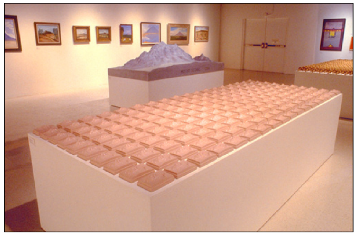
Allan McCollum. Mount Signal Souvenirs for the Imperial Valley. 2000. Plaster, latex paint. Installation: The University Gallery, San Diego State University, San Diego, California

oversaw the construction and installation of a sixteen-foot version of the sand spike and a large model of the mountain. Lastly, McCollum created a set of sixteen informational booklets that were derived from historical and scientific articles on sand spikes and the mountain.