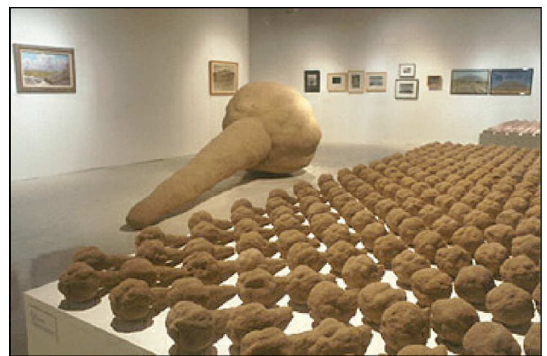
Allan McCollum. Sand Spike Souvenirs for the Imperial Valley. 2000. Plaster, white glue, and sand from Mount Signal. Installation: The University Gallery, San Diego StateUniversity, San Diego, California

curators, collectors, dealers, critics and viewers is seen by McCollum as participating in the same quest as a community striving to project a winning image to the society-at-large. McCollum's joint examination of the ways in which both objects and communities accrue cultural importance was pursued in the Imperial Valley/Valle de Mexicali, an expansive desert region east of San Diego County and spanning the U.S./Mexico border. The artist was drawn to this area for two reasons. First, he was inspired by the strange geological formations, known as sand spikes, found at the base of Mount Signal/El Centinela, a prominent feature of the area's landscape that itself straddles the international boundary line. Thousands of these ancient sand spikes were formed as concretions—grains of sand cemented together with crystalline calcite—and lay together at the foot of the mountain, pointing westward, until they were excessively collected throughout the 20th century. Today the sand spikes can only be found in museums and private collections.