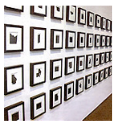
Allan McCollum. Recognizable Image Drawings , 2003. Graphite pencil on rag paper.

In his latest show at Friedrich Petzel, Mr. McCollum, true to form, recycles some of his infinitely recyclable motifs. These are new, enlarged versions of his "Perpetual Photos" from 1982, the small, lessthan-artworks, you might say, that he spotted in the backgrounds of sundry television shows and photographed. Originally 8 by 10 inches, these images are now monumental, like details of photographs that would cover most of the wall. Some