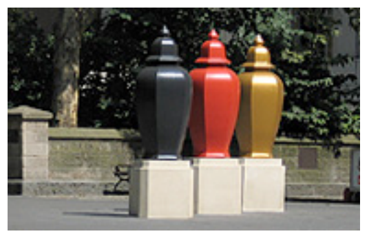
Allan McCollum. Perfect Vehicles , 1988/2004. Acrylic latex on concrete.