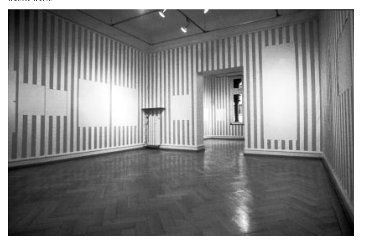
DANIEL BUREN, photo-souvenir: À PARTIR DE LÀ..., travail in situ, Städtisches Museum, Mönchengladbach, November 1975, detail, see/siehe CABANE NO. 0, 1975–1982, p./S. 68.