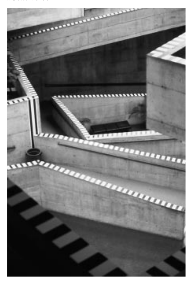
DANIEL BUREN, photo-souvenir: STALACTIC/STALAGMITIC: A DRAWING IN SITU AND THREE DIMENSIONS, travail in situ, University Art Museum, Berkeley, California, 1979, detail.

pedestal and core. While other works are subject to classification and relocation, generally in isolation from their original historical or cultural conditions, UP AND DOWN... cannot be considered apart from the architectural and institutional reality into which it is absorbed and with which it visibly coexists.