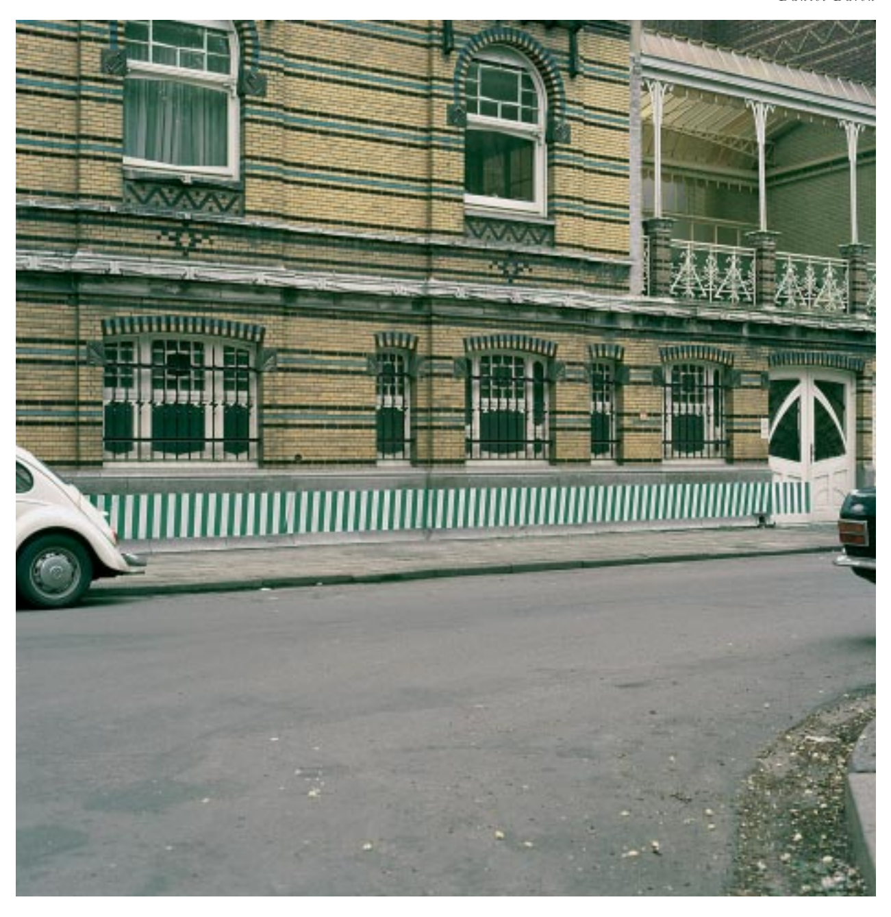
DANIEL BUREN, photo-souvenir: (SANS TITRE), travail in situ (extérieur), Wide White Space Gallery, Anvers, January 1969, detail. (COPYRIGHT: DANIEL BUREN)