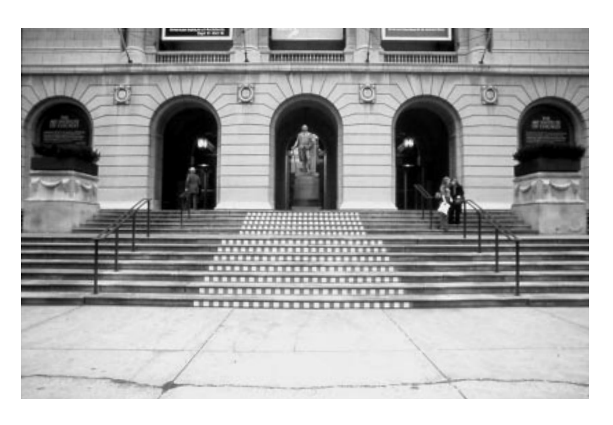
DANIEL BUREN, photo-souvenir: UP AND DOWN, IN AND OUT, STEP BY STEP, travail in situ (extérieur), Art Institute of Chicago, 1977, detail.