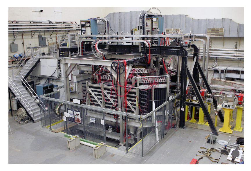
Bates Large Acceptance Spectrometer Toroid

OLYMPUS, at DESY (Deutsches Elektronen-Synchrotron) in Hamburg, Germany, to use BLAST to determine fundamental aspects of electron scattering from the proton. A new high performance research computing facility has recently been completed at Bates for analysis of data from the LHC and from the Laser Interferometer Gravitational Wave Observatory Experiment and for other researchers at MIT. In addition, several projects which utilize low energy accelerators are in preparation at Bates.