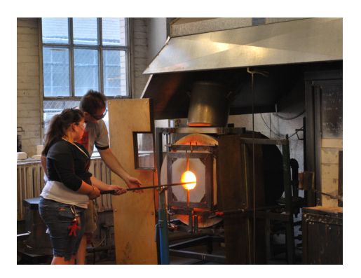
2009 CMSE middle school program glassblowing project.

The program covers a wide variety of topics. Most activities take place during 90-minute periods, and some include multiple sessions. The 2009 program included glassblowing, polymer demonstrations, electric circuitry, metal casting, and an engineering design contest. Each year the program concludes with the "Shoot-the-Hoop" design competition, to which families of program participants are invited. Activities offered are evaluated and modified each year by Professor Leeb and the program staff. Program activities are designed and taught by MIT faculty, staff, graduate students, and undergraduates. CMSE has