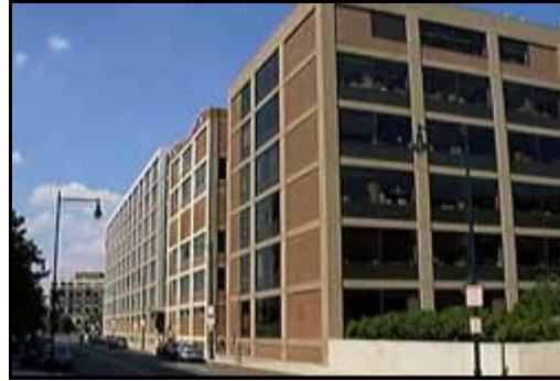
View from Southwest Corner

General Directions: MIT's Center for Biomedical Innovation is located at 400 Main Street (Building E19) at the intersection with Ames Street, across from Legal Sea Food. Enter through the glass doors on Main Street. The elevator is located at the top of the stairs. Take elevator to the 6 th floor. Make a left upon exiting the elevator. Room 611 is located on your right, past HRS and the Knight Science Journalism Fellowship. For assistance at any time, call Cheryl Mottley at 617.253.0257.