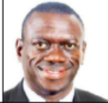
SAMPLE BALLOT 4