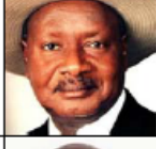
SAMPLE BALLOT 4