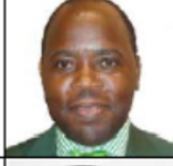
SAMPLE BALLOT 4