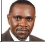
SAMPLE BALLOT 4