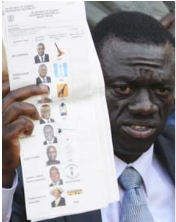
SAMPLE BALLOT 5