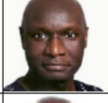
SAMPLE BALLOT 4