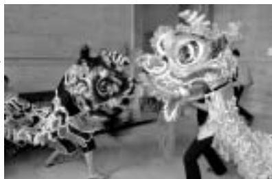
Chinese lion dance at MISTI Week.

Council. MISTIWeek, which began with a cultural fair at the MIT Student Center on September 18th that featured Indian dance, Mexican mariachi, a Chinese lion dance, Japanese taiko drumming and Spanish flamenco, involved seminars, activities and other films, as well as orientation sessions for MISTI's eight study-abroad programs.