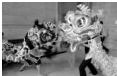
Chinese lion dance at MISTI Week.

Council. MISTIWeek, which began with a cultural fair at the MIT Student Center on September 18th that featured Indian dance, Mexican mariachi, a Chinese lion dance, Japanese taiko drumming and Spanish flamenco, involved seminars, activities and other films, as well as orientation sessions for MISTI's eight study-abroad programs.