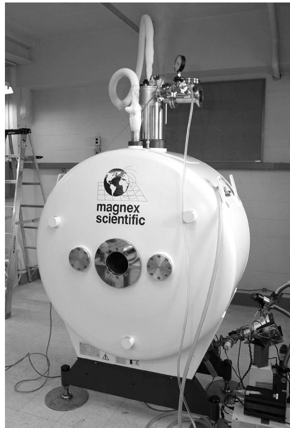
Photo 1: A photograph of the 6.2 T superconducting magnet during the nitrogen pre-cool phase.