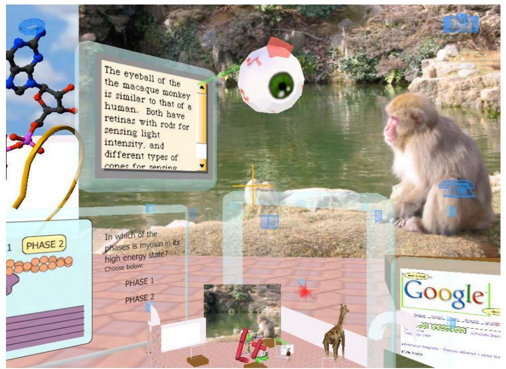
A meta-medium application consisting of a 3D molecular model, 2D Flash, and a Web page, all annotated with text voice, video, and 3D portals constructed with Brie in Croquet

<http://www.duke.edu/~julian/Cobalt/Home.html>. Perhaps, the developmental evolution of Croquet is itself an excellent example of MM in situ as experts from a variety of fields and knowledge bases work together, usually virtually, to define, develop, and distribute metamodal products that require transdisciplinary collaboration to even be conceived of in the first place.