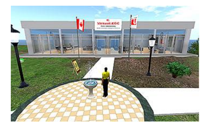
The York University Virtual Disaster and Emergency Lab in Second Life

SL offers a contemporary 3D virtual learning environment and community, beyond historic brick-and-mortar buildings that comprise higher education physical campuses and learning spaces, opening up a world where an endless array of multimodal technologies can form new possibilities for the educative process and are welcomed beyond the normal print text emphasis in higher education. SL as a virtual classroom is embraced by major colleges and universities, including Harvard University, the Massachusetts Institute of Technology, and Stanford University, to name but a few (Second Life, 2008). This type of virtual environment for contemporary higher education students who have grown up in a wired world, illustrates the kind of learning space attuned to those Web 2.0 students who keep updated and informed about current cyber developments through, for example, social networking sites such as Facebook and grassroots information networks disseminated through wikis and blogs.