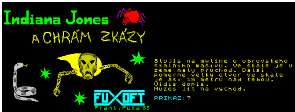
Fig. 1. The loading screen (left) and the opening screen of the first Czechoslovak Indiana Jones game (Fuka, 1985). Unlike in most of the later text adventures, there were no diacritics. The game screen reads: “You are standing on a clearing near a huge rock massif. There is small opening in the rock at the ground level. Another quite big opening is about 15 meters above you. You can see a letter. You can go east. Command: ?”

But what are the specifics and conventions of the genre? Genre definitions shift with passing time and it is often easier to define a genre based on family resemblances, rather than a set of conditions and features. According to histories of text adventures, the genre descends from the game Adventure (Crowther, et al., 1976) that originated on mainframe computers in the 1970s United States’ research labs and universities. The genre experienced its “golden age” in the USA in the early and mid-1980s and has since then moved to the fringes of digital entertainment (Aarseth, 1997; Montfort, 2005). These days, it is usually called interactive fiction or IF by both its creators and scholars.