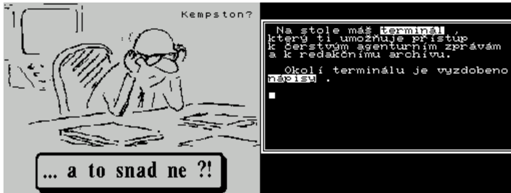
Fig. 5. The title screen and an in-game screenshot of ...and what about that?! The illustration was drawn by Vladimír Jiránek, a prominent political cartoonist of the transformation era. The in-game screen reads: “There is *terminal* on your desk, that connects you to the newest agency news reports and the paper’s archive. The surroundings of the terminal are decorated with *messages* .” (Fait, et al., 1990)

Although ...and what about that?! is a transformation-era game, its roots lie within the pre-1989 gaming culture centered around both the underground hobbyist scene and the computer clubs run by youth organizations. It also proves the popularity of the text adventure genre (and similar genres) at the turn of the decade.