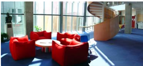
View of the LIDS student lounge, 6th floor

In AY2004, LIDS maintained its visibility in teaching and research. Research volume continued to remain strong at just over $6.5 million.