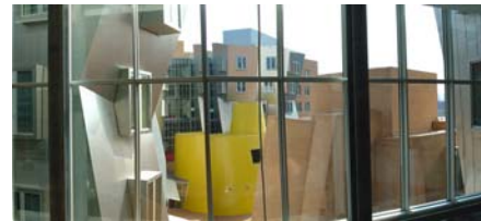
View from the window of the LIDS student lounge, on the 6th floor of the Stata Center's Dreyfoos Tower

The lab has had a very exciting and successful year in AY2004. It is poised for greater achievements in a state-of-the-art research facility—the Ray and Maria Stata Center for Computer, Information, and Intelligence Sciences—in the upcoming year.