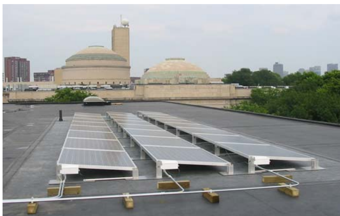
Solar panels installed on the roof of N52

The EHS Office also worked with the City of Cambridge to meet the goals of the Cambridge Climate Action Plan and in a grant application for biodiesel use in Institute vehicles. The office worked with the Department of Facilities to install solar panels on the roof of N52, the location of the EHS Office, in spring 2004. The panels have the capacity to generate 2,400 watts of electricity during full-sun conditions, offsetting some of the power consumed by EHS. The panels were part of the grant provided to MIT by the Massachusetts Technology Collaborative.