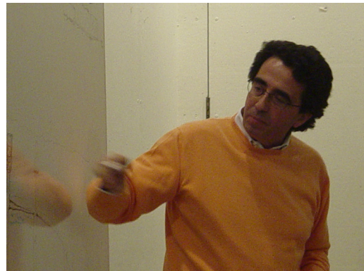
Santiago Calatrava, 2005 Eugene McDermott Award recipient.

The Eugene McDermott Award recipient for 2005 was architect/engineer/artist Santiago Calatrava. Before a crowd of 700 people, many of whom were in overflow seating, Calatrava shared images of his recent prolific and highly acclaimed creations, ranging from a building designed for the Athens Olympic Games to the PATH Station in New York City. Calatrava