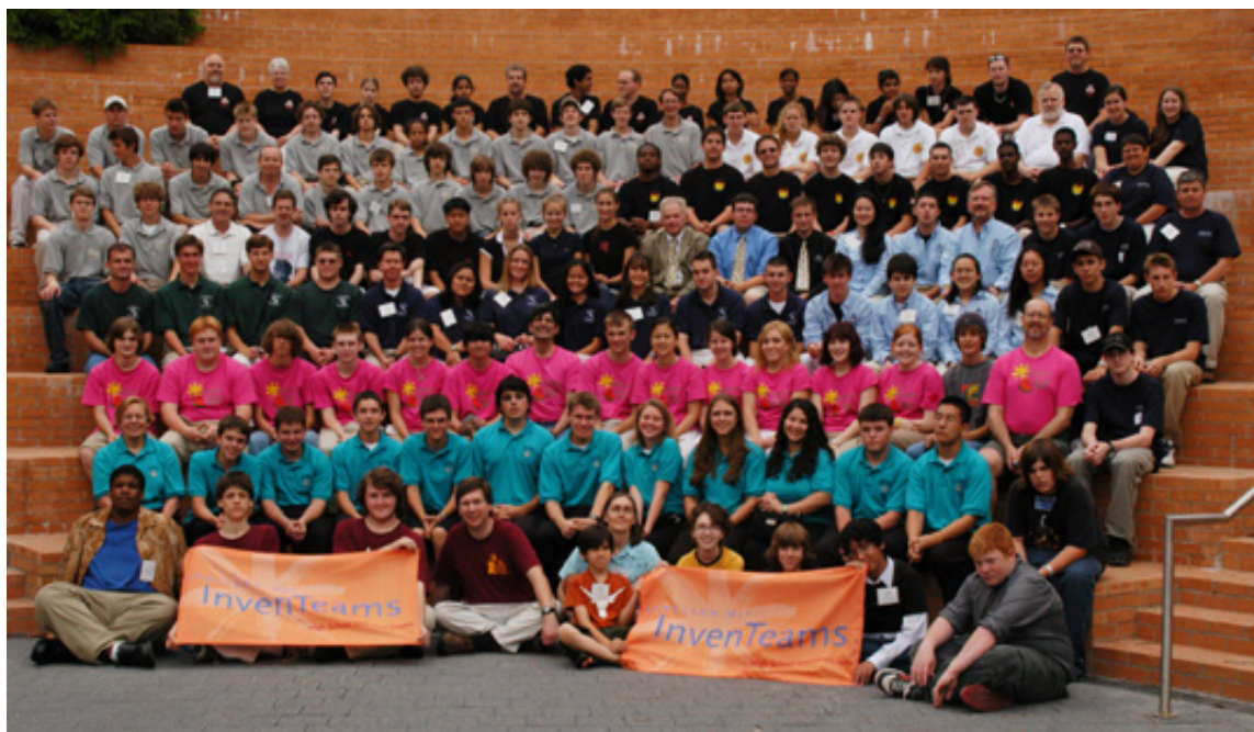
High school students and teachers representing 13 InvenTeams at the InvenTeams Odyssey at MIT

Following the InvenTeams Odyssey, all of this year's projects were brought to the MIT Museum for an exhibit displayed through August 15. More information about InvenTeams can be found on the web at http://web.mit.edu/inventeams/ or http://www.inventeams.org/ .