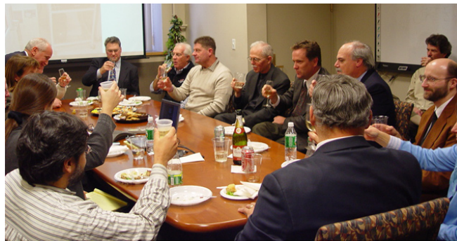
Dedication of the Substrate Engineering Lab and Nanoprecision Deposition Lab, November 2004.

The renovation of the 1,063-square-foot Characterization Lab for Photonic Materials and Integrated Devices, located in Building 12, has also been completed. This renovation, originally estimated to cost $400,000, was accomplished under severe budget constraints for only $20,000. By combining equipment from faculty laboratories and buying like-new state-of-the-art equipment at auction, it was possible to reduce the cost of the renovation by 95 percent. Five years ago sequential characterization was unnecessary, but with the new facility it is possible to perform 200 to 300 measurements overnight. The equipment in the Characterization Lab includes the Newport AutoAlign Workstation, a measurement system for high-speed detectors and modulators, and the Waveguide Evaluation Systems I and II. Still under construction is a TOSA/ROSA evaluation system.