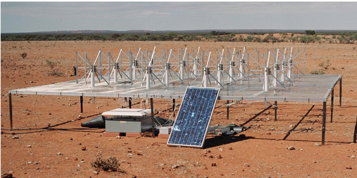
One of three test antenna “tiles” at Mileura Station in Western Australia. Built at Haystack Observatory, these tiles are being tested in the field in preparation for the construction of an array of 500 elements. Each tile consists of 16 crossed-dipole, low-frequency antennas, connected together electronically to form a single unit. The operating frequency range is 80–300 megahertz. The Mileura Widefield Array has as one of its goals the detection of the neutral hydrogen gas that is believed to have existed in the universe before the formation of stars and galaxies. Mapping this primordial hydrogen will give us important information about the process of structure formation and about the initial conditions of fluctuations established during the inflationary epoch of the early universe.

Looking toward future missions, high performance X-ray sensors are being investigated in collaboration with MIT's Lincoln Laboratory. Event-driven CCD's are under development for NASA's Constellation X mission and promise to reduce greatly the power requirements for future astronomical X-ray CCD cameras. In another development with astronomical applications, single X-ray photon counting by a complementary metal-oxide semiconductor active pixel sensor has been demonstrated at room temperature. A new program directed toward the use of X-ray sensors for celestial navigation has been initiated. Two new spectrometers and an adaptive optics system for the Magellan telescopes are under development. With Haystack Observatory, work