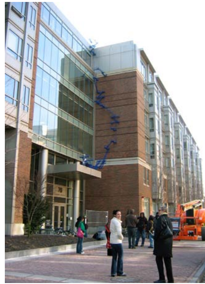
Artist Sarah Sze, white jacket, overseeing the installation of her work, Blue Poles, at the Sidney-Pacific dormitory.