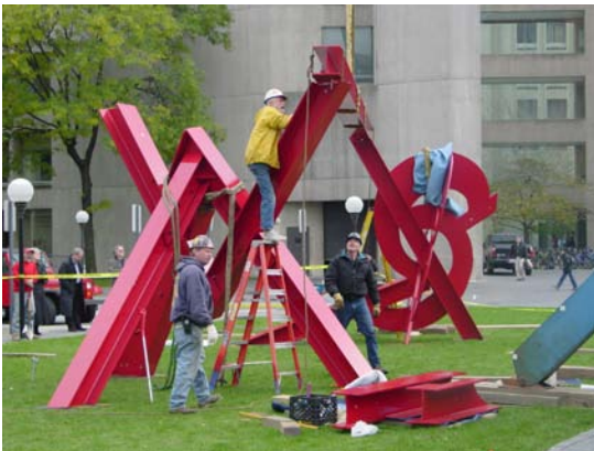
Artist Mark di Suvero (on ladder) and a team of assistants spent the better part of a day installing this sculpture on the lawn near the Stata Center.