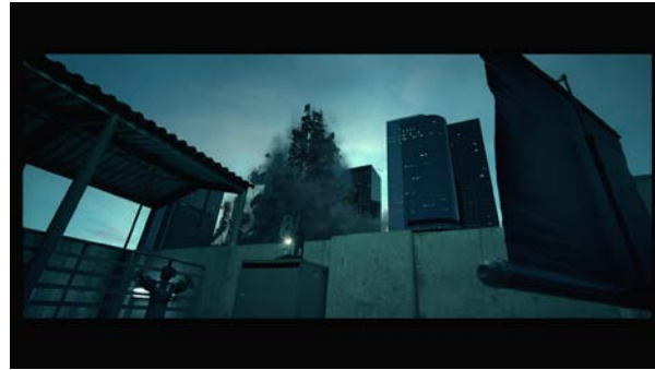
A dramatic image from Christian Jankowski's film 16mm Mystery.

One of Germany's most prominent young artists, Jankowski often collaborates with others—including children, magicians, customs officials, artists, therapists, psychics, and theologians—and his performance work frequently involves a surprising turn of events and a subtle but engaging sense of humor. This exhibition, the first large-scale survey of Jankowski's work, included 12 film and video installations as well as 54 photographs by the artist. The exhibition was organized by the Des Moines Museum of Art.