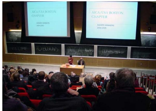
The annual awards ceremonies for the best art projects in New England drew a full house.