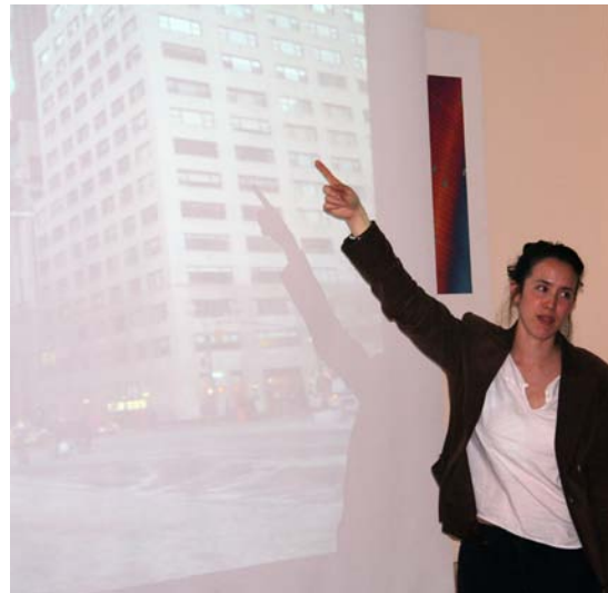
Approximately 70 students came to hear Sarah Sze speak at the Sidney-Pacific graduate dormitory, where her artwork was recently installed on the façade.