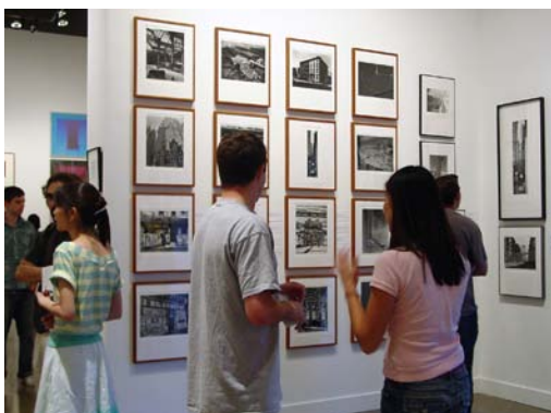
Students looking at an array of photographs by Berenice Abbott available for loan.