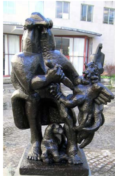
Images of Jacques Lipchitz's Sacrifice III, before and after treatment, showing the dramatic effects of art conservation.