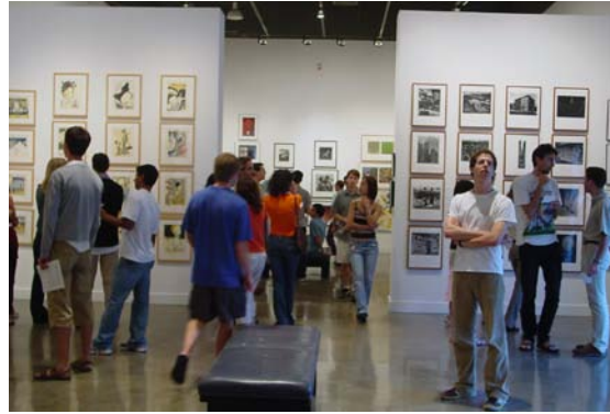
Well over 1,000 MIT students entered the free lottery to borrow prints and photographs for the year.

At the annual exhibition of works from the Student Loan Art Collection, MIT students viewed displayed works and then entered a lottery to be awarded the work of their choice on loan to hang in their dormitory, apartment, or office for the academic year.