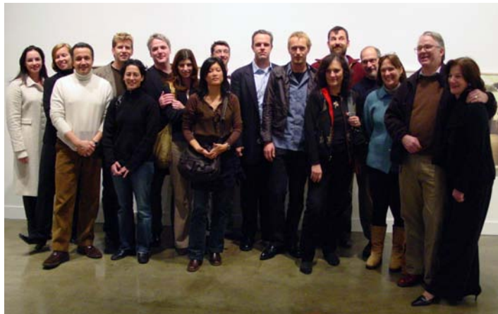
Some of the Friends of Boston Artists group with artist Christian Jankowski, who led a tour of his exhibition.