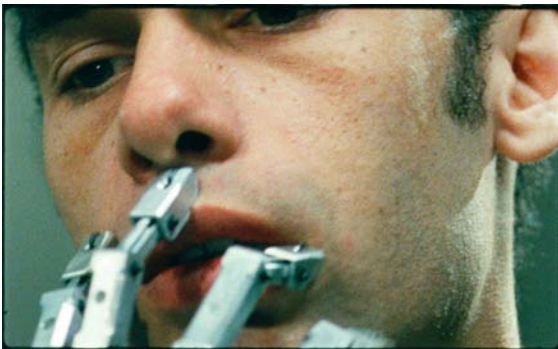
Close-up image of Daria Martin's film depicting a male dancer with a robot.

This exhibition featured a 16-mm film titled Soft Materials by Daria Martin, an American artist living and working in London, and a large five-screen video installation, whenever on on on nohow on / airdrawing , by German artist Peter Welz in collaboration with celebrated dancer/choreographer William Forsythe. The exhibition, which offered audiences the opportunity to consider the space between dance and moving image in contemporary art practice, was organized by LVAC curator Bill Arning.