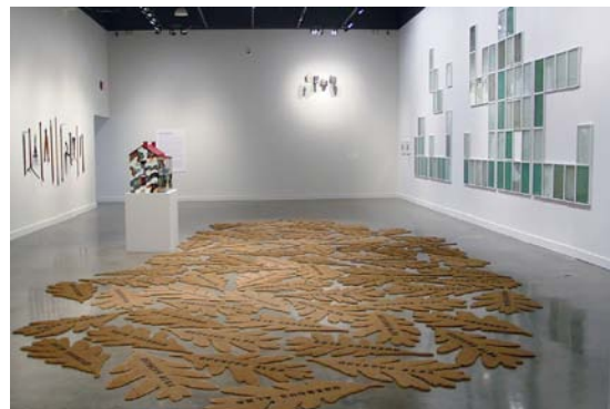
Installation view showing some of the many large-scale public projects for which Kate Ericson and Mel Ziegler are known.

Ericson and Ziegler's work focuses on unnoticed aspects of public life, transforming ordinary materials—books, lumber, house paint, canning jars, tap water—into artworks with social meaning and commentaries. Organized by LVAC and the Tang Teaching Museum and Art Gallery at Skidmore College, America Starts Here was the first retrospective exhibition of the art-making team's decade-long career, which was cut short by Ericson's death of cancer in 1995 at the age of 39. The exhibition was accompanied by a catalogue published by MIT Press.