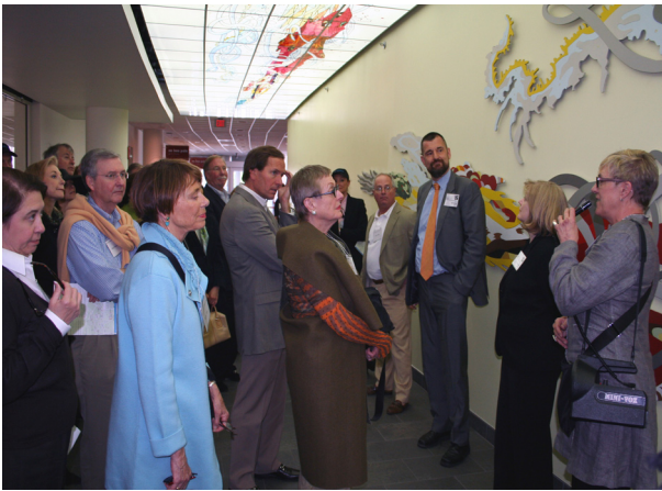
LVAC staff members gave a public art tour to members of the Whitney Museum of American Art's National Council. They are seen here in the Zesiger Center, surrounded by Matthew Ritchie's Percent-for-Art commission.