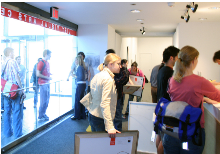
A rush of MIT students pick up artwork from the annual Student Loan Art Program in September.