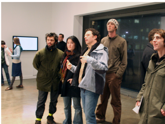
Visitors from MIT's Department of Architecture explore architect François Roche's plans for a pavilion that would convert urine into tea. The plans were on view in Sensorium: Part II.