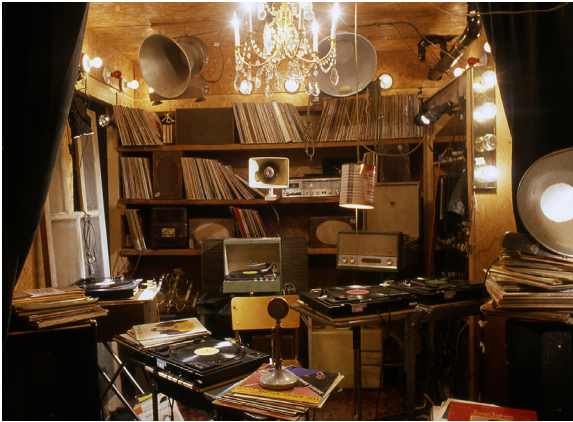
An image of Janet Cardiff and George Bures Miller's sound installation Opera for a Small Room from the exhibition Sensorium: Part I.

This exhibition included a trio of works— Forsaken (2003), Crash (2004), and All Day and a Night (2005)—each of which was made up of a series of vignettes enacted by an ensemble of characters who perform complex and shifting psychological games about