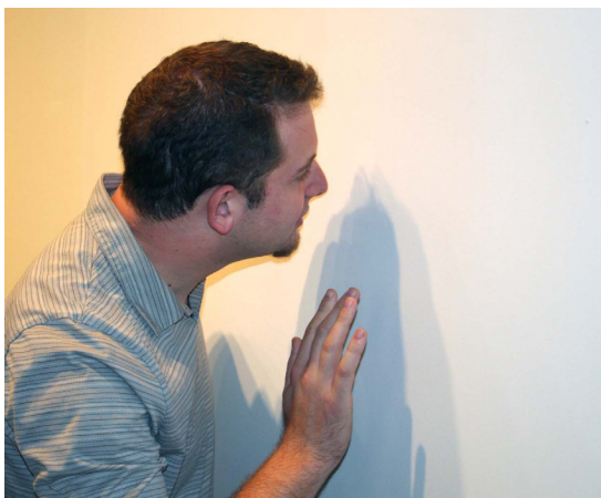
A local artist experiences Sissel Tolaas's art: a wall covered in paint that included microencapsulated odors.