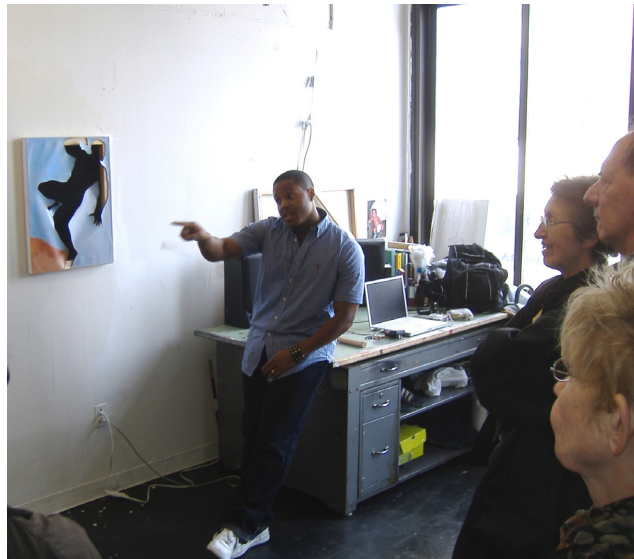
Members of LVAC's Friends Group toured Titus Kaphar's studio during a trip to Harlem and the Bronx.

More information about the MIT List Visual Arts Center can be found at http://web.mit.edu/lvac/ .