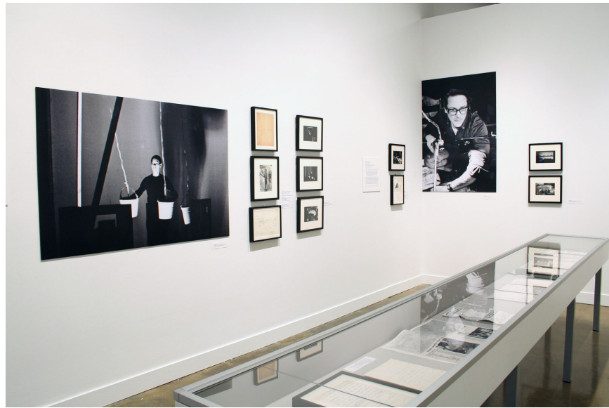
An installation view of 9 Evenings Reconsidered, an exhibition that explored a series of important performance events in New York City. The exhibition toured to Montreal after closing at MIT in the spring.