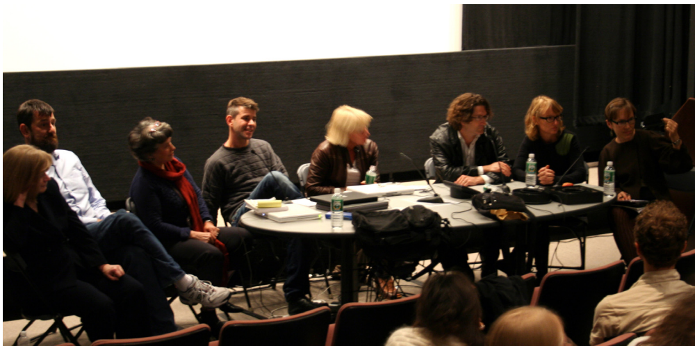
Artists, curators, and writers field audience questions after a panel discussion on Sensorium .