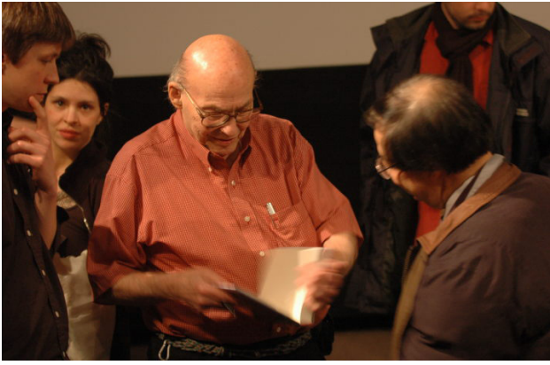
Fans surround Marvin Minsky, emeritus professor of media arts and sciences and a founder of the study of artificial intelligence, after he spoke about the film 2001: A Space Odyssey, for which he was an on-set advisor to Stanley Kubrick.

• A lecture by MIT Professor Marvin Minsky, a leader in the field of artificial intelligence, on 2001: A Space Odyssey (April 5, 2007).