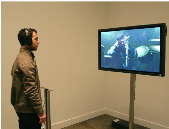
Albanian artist Anri Sala had two works in Sensorium: Part II (as well as a project on the Media Test Wall in the spring).

This exhibition was an interactive installation and video project that addressed the artist's Palestinian heritage as well as technology's potential to foster mutual understanding among people of different cultural and geographic backgrounds. Exhibition visitors were able to communicate with visitors at the Bethlehem Peace