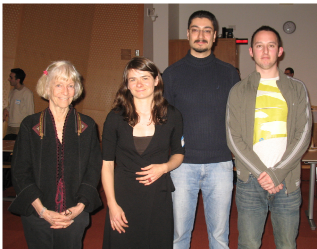
Left to right: Moderator Joan Jonas (Visual Arts Program) with presenters Sabrina Kleinenhammans (graduate student, architecture), Masoud Akbarzadeh (graduate student, architecture), and Jamie Zigelbaum (graduate student, media arts and sciences) at the "Sketched Out" Graduate Arts Forum in spring 2008.