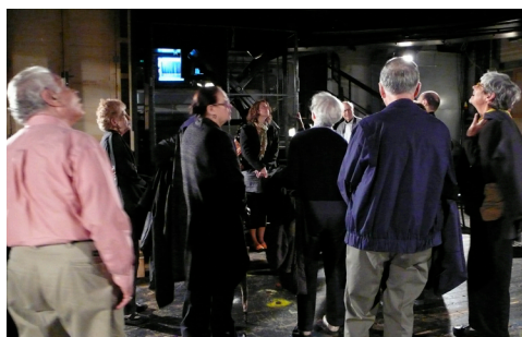
Members of the Council for the Arts under the stage at the State Theater, where Don Giovanni premiered in 1787.

The Council for the Arts also sponsors a student membership program with the Photographic Resource Center (PRC) at Boston University. The PRC provides a range of programs, including exhibitions by national and international photographers and educational programs. MIT undergraduates and graduate students have free unlimited access to the PRC galleries and library and receive member discounts on admission to lectures, workshops, and other special events. They can also enter their work into the juried members' exhibition.