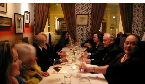
Members of the Council for the Arts at dinner on their final evening in Prague.

The council underwrites MIT's institutional membership at the Harvard Art Museums, allowing all MIT graduate and undergraduate students free admission to the Fogg, Busch-Reisinger, and Sackler museums as well as to the Agnes Mongan Center for the Study of Prints, Drawings, and Photographs.