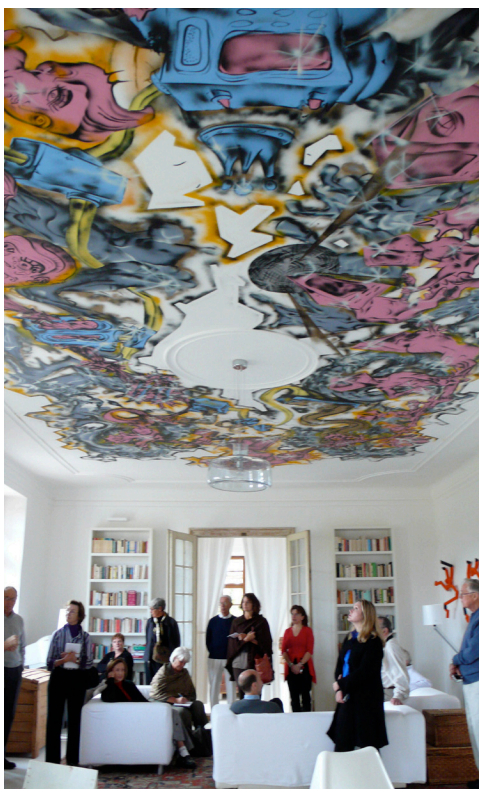
Council for the Arts tour of Trebesice Castle in Prague (which houses a contemporary artist residency program).

MIT undergraduate and graduate students, as well as 10 day passes for use by MIT faculty and staff.