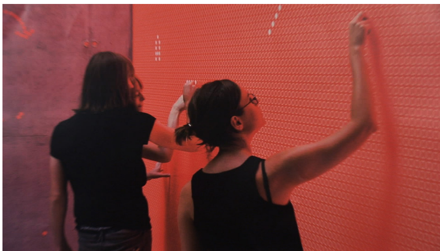
Appeel, by Richard The, is a virus spreading through interacting individuals. It demonstrates the basic principles of interactivity largely reliant on people's behavior. A surface is covered by a large number of colored stickers, positioned in a grid. People can remove stickers, leaving white spots in the layout, thereby individually and collectively changing the wall's appearance. These stickers then take on a life of their own as they spread, extending beyond the installation itself, infiltrating private space, and merging the boundaries of public and private space.