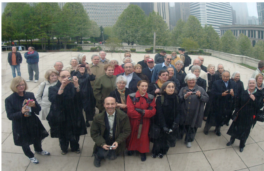
CAMIT members reflected in Anish Kapoor's Cloud Gate in Millennium Park, Chicago.