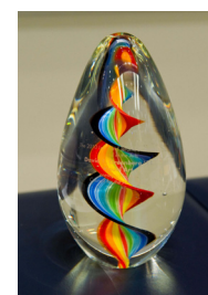
The new trophy presented as part of the prize package for the CAMIT student arts awards.