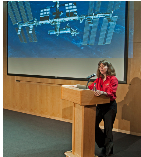
Astronaut and MIT alum Cady Coleman was a featured speaker at AeroAstro’s 2012 Women in Aerospace Conference.