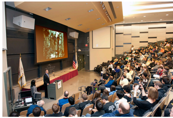
Video game entrepreneur and commercial space use supporter Richard Garriott speaks to 2011 Zero Robotics finalists at MIT. On screen, the live downlink from the ISS will show the SPHERES microsatellites executing the students' competing programs.

Station since May 2006. In 2009 we expanded the uses of SPHERES to include STEM outreach. In the fall of 2009 (as noted above), we began an exciting program called Zero Robotics to engage high school students in a competition aboard the ISS using SPHERES. In December 2010, 10 students from two Idaho schools came to MIT and saw their algorithms compete against each other in a live feed from the ISS. Since then, Zero Robotics has been expanded to include middle school programs as well as a competition in Europe. In 2012, more than 130 high schools nationwide and 20 schools in Europe competed. Also in 2012, the SPHERES facility on the ISS was expanded to include vision-based navigation and magnetic control of satellite formations.