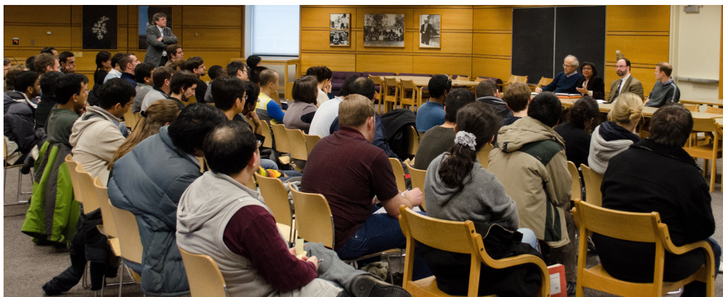
Postdocs participating with faculty panel at Landing That Next Position seminar.