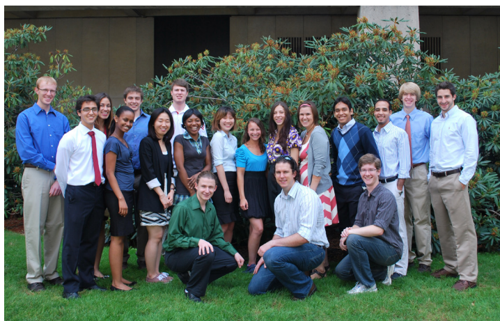
REU (Research Experiences for Undergraduates) participants

The results of the cross-site REU assessment indicate that the CMSE REU program had a positive impact on students' professional development and their career plans. All of the interns rated the REU experience overall as either good or excellent, and 89% felt their summer research experience increased their confidence in their ability to contribute to science. In addition, all of the participants said that the experience confirmed their interest in their chosen field of study, and all felt that the program prepared them for graduate school.