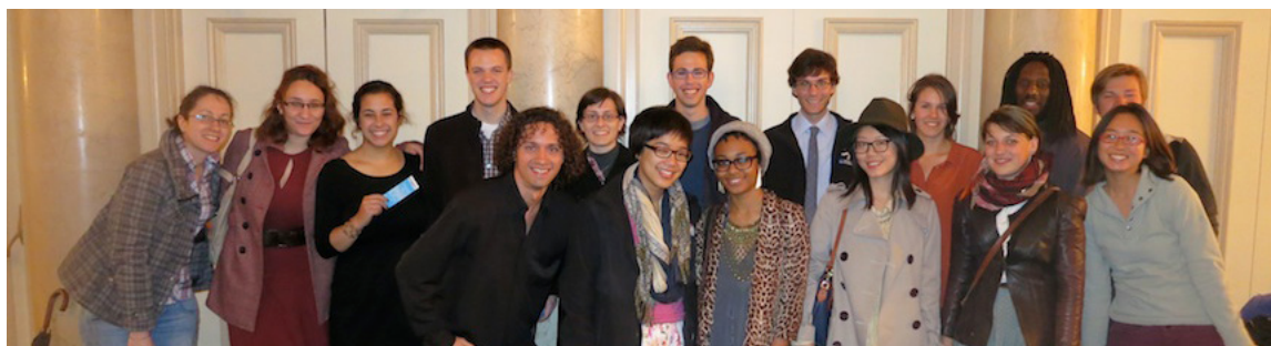
The Arts Scholars after the Q and A with two Alvin Ailey company dancers.