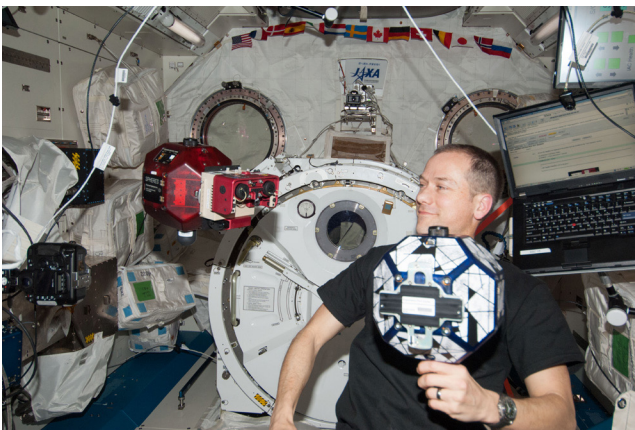
Aboard the International Space Station, astronaut Tom Marshburn works with an MIT Space Systems Lab SPHERES micro satellite. The visually enabled SPHERE is the red object on the left—it's scrutinizing a target SPHERE that Marshburn's holding.

Several Space Systems Laboratory (SSL) initiatives study the development of formation flight technology. The Synchronized Position Hold Engage and Reorient Experimental Satellites (SPHERES) facility is used to develop proximity satellite operations, such as inspection, cluster aggregation, collision avoidance, and docking. The SPHERES facility consists of three satellites 20 centimeters in diameter that have flown inside the International Space Station (ISS) since May 2006. In 2009, the SSL expanded the uses of SPHERES to include science, technology, engineering, and mathematics (STEM) program outreach through an exciting program called Zero Robotics, which engages high-school students in a competition aboard the ISS using SPHERES ( http://www.zerorobotics.org/ ). In December 2010, 10 students from two Idaho schools came to MIT and saw their algorithms compete against each other in a live feed from the ISS. Since then, Zero Robotics has been expanded to include middle-school programs as well as a competition in Europe. In 2012, 96 teams from the United States and 47 teams from Europe competed.