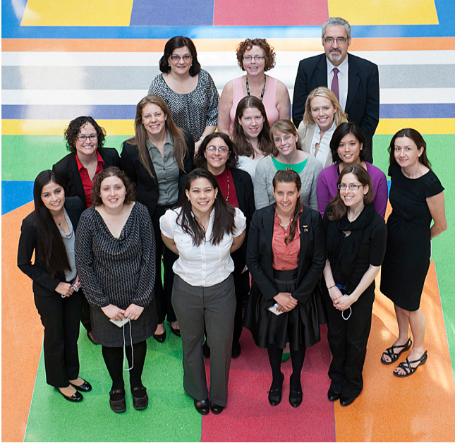
Our fifth Women in Aerospace conference was held in April. The series of presentations by top women aerospace doctoral students from around the United States fosters networking and collegiality.