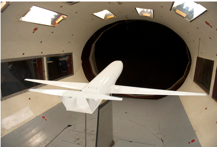
A 1:10 model of the D-8 commercial aircraft concept is prepared for testing in AeroAstro's Wright Brothers Wind Tunnel. Designed by an MIT-led team, the 737-size plane could burn 70 percent less fuel than current aircraft while reducing noise and nitrous oxide emissions.

Since its opening in September 1938, the Wright Brothers Wind Tunnel (WBWT) has played a major role in the development of aerospace and civil engineering and architectural systems. In recent years, faculty research interests generated long-range studies of unsteady airfoil flow fields, jet engine inlet-vortex behavior, aeroelastic tests of unducted propeller fans, and panel methods for tunnel wall interaction effects. Industrial testing has ranged over auxiliary propulsion burner units, helicopter antenna pods, and in-flight trailing cables, as well as concepts for roofing attachments, a variety of stationary and vehicle-mounted ground antenna configurations, the aeroelastic dynamics of airport control tower configurations for the FAA. There have also been tests of Olympic ski gear, of space suits for tare evaluations related to underwater simulations of weightless space activity, and of racing bicycles, subway station entrances, and Olympic rowing shells for oarlock system drag comparisons.