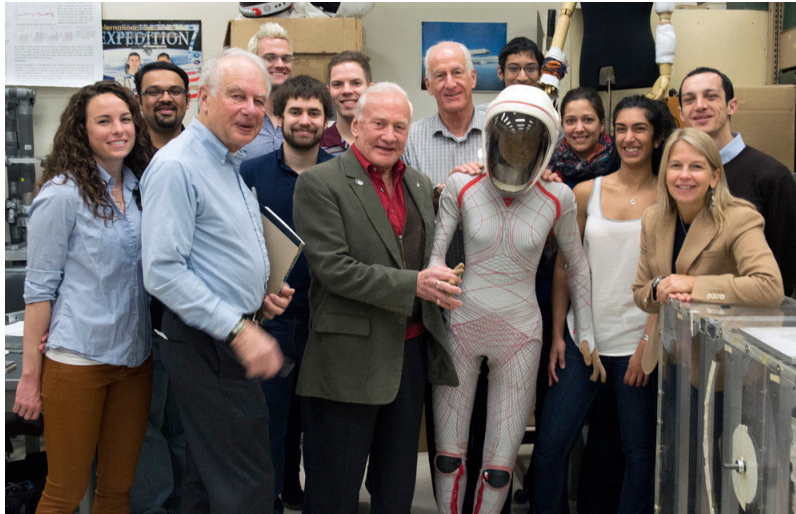
During an April 2013 visit to the Man Vehicle Lab, AeroAstro alumn Buzz Aldrin (ScD '63) poses with faculty, students, and a mannequin that's wearing one of the lab's designs for a next-generation space suit.

Women’s Hospital. Non-aerospace projects include performance and fatigue effects in locomotive engineers and advanced helmet designs for brain protection in sports and against explosive blasts. A new undertaking with Russian colleagues, under the umbrella of the MIT Skoltech Initiative, emphasizes innovative solutions to the protection and performance enhancement of astronauts during space exploration. MVL projects include the use of a short-radius centrifuge as a countermeasure, the development of a g-loading suit to maintain muscle and bone strength, and the logistics of resupply and mission support.