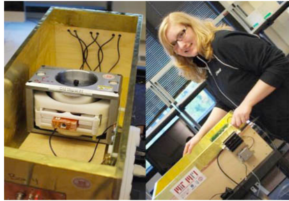
Figure 2. Tabletop magnetic resonance imager developed for use in 6.S02 during the 2013 spring term.

Over the past year, the department's teaching laboratories have supported a wide range of EECS core and laboratory subjects that offer hands-on experience and education in a substantial range of topic areas, including but not limited to energy conversion (6.007, 6.131, 6.A47, 6.A48), digital design (6.111, 6.004), embedded control (6.115), power electronics (6.131), silicon microfabrication (6.152J), analog design (6.101, 6.301, 6.302, 6.331), wireless communication (6.02, 6.102), optics and lasers (6.007, 6.161), bioelectrical engineering (6.123J), and robotics, motion, and task planning (6.01, 6.141, 6.142).