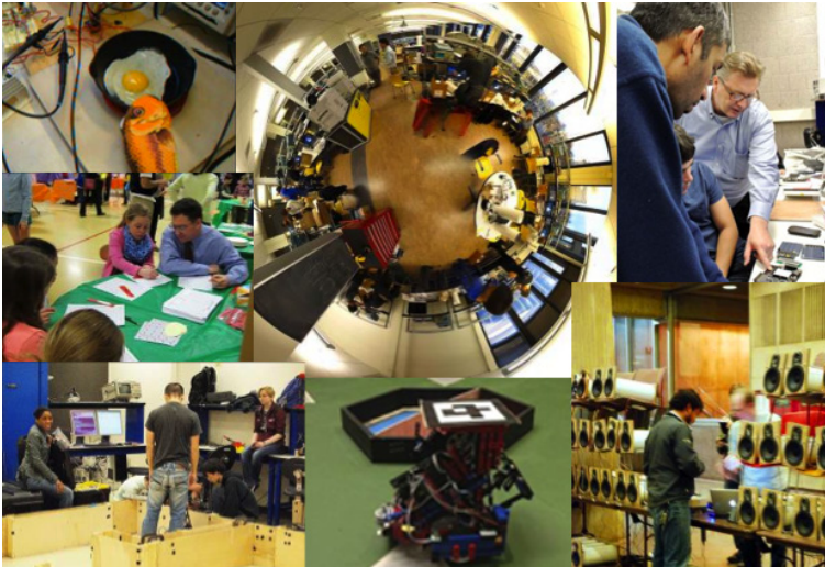
Figure 3. Examples of the many uses of the department's teaching laboratories in AY2013.

Students from the Sloan School of Management and from various departments (e.g., Mechanical Engineering, Aeronautics and Astronautics, Physics, Mathematics, and Earth, Atmospheric, and Planetary Sciences) benefit by working in the EECS department laboratories. The department laboratory subjects also provide training and equipment that support projects in laboratory classes in other departments. For example, activities from EECS laboratory subjects have become the centerpiece for the degree-requirement course 2.670 Mechanical Engineering Tools. These activities have also provided demonstrations for General Institute Requirement subjects such as 18.03 Differential Equations, facilities for freshman seminars, and activities for outreach programs with international extent, including the Women's Technology Program, the Center for Materials Science and Engineering educational outreach program, the Cambridge Science Festival, Campus Preview Weekend, and innumerable outreach activities for local K–12 schools, teacher organizations, and organizations such as the Boy Scouts and Girl Scouts.