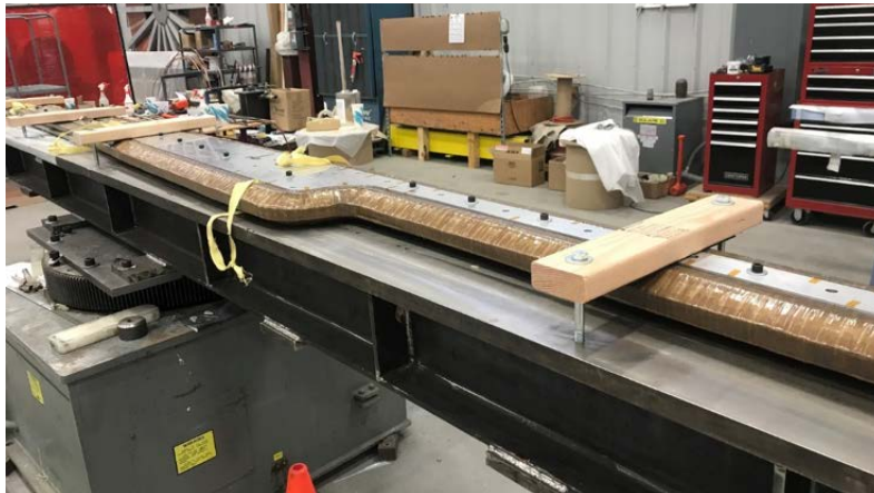
The prototype coil for the MOLLER experiment hybrid toroid on its winding frame, mounted on a steel support beam for shipping.

MIT Bates physicists, engineers, and technicians have also made contributions to many of the experiments discussed above.