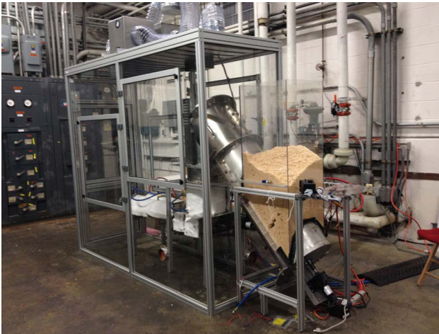
A prototype biomass torrefaction reactor. Biomass waste is fed into the system through the hopper above the large cylinder in the smaller rectangular enclosure at right and heated inside two pipes toward the bottom of the larger rectangular enclosure in an oxygen-free environment. The enclosure is approximately 2 m tall.

Another project focuses on machining components for a biomass torrefaction reactor being developed by researchers in the Department of Mechanical Engineering. The reactor is intended to take biomass waste from small farms and heat it in an oxygen-free environment so that it rapidly decomposes and releases low-energy molecules, resulting in compact waste with high energy density. This project is being conducted at MIT Bates.