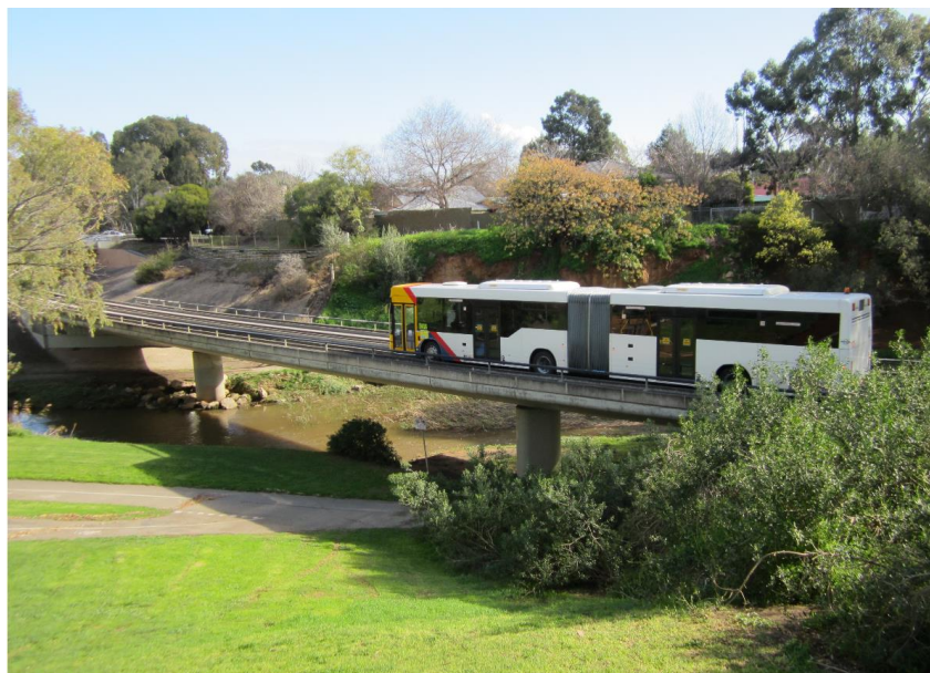
Fig.3 Double articulated M.A.N. diesel bus on Adelaide OBahn