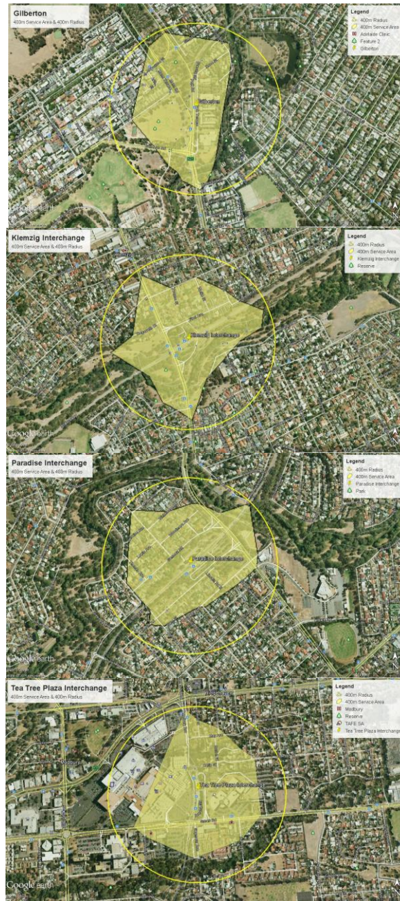
Fig.4 Pedshed analyses for OBahn case study pedsheds