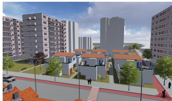
Fig. 4. Resulting simulation from the placement of units on the site shows integration of housing with the surrounding urban context. Created by authors.

The apartments were subsequently implemented within the ZEIS as to derive values, which could simulate an ideal balance between the provision of affordable housing while also guaranteeing sustainable developments and integration with the city (Figure 4).