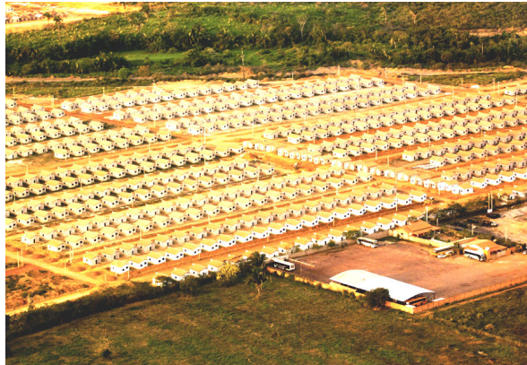
Fig. 1. Housing complex with 1000 units built in Parauapebas (Pará) in 2012 is disconnected from urban center and illustrates suburban pattern of development.