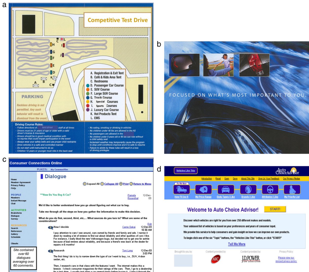
Fig. 1. Year-1 (Random Assignment) Competitive-Information Treatments.

technical difficulties with the competitive online advisor, and a few could not come to the competitive test drive due to last-minute scheduling issues. Take-up rates were 91.1% for competitive test drives, 99.4% for brochures, 97.4% for the community forum, and 82.1% for the online advisor. The high take-up rates and the similarity of coefficients suggest that treatment take-up (given it was offered) was sufficiently random that take-up selection had little or no effect in year 1. We thus leave analyses of self-selected take-up to year 2 when the trust signal is more cleanly implemented.