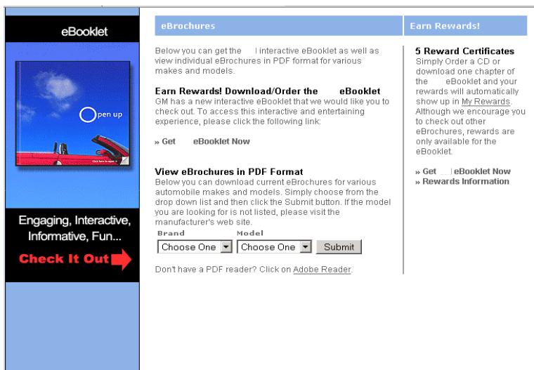
(b) Competitive E-Brochures