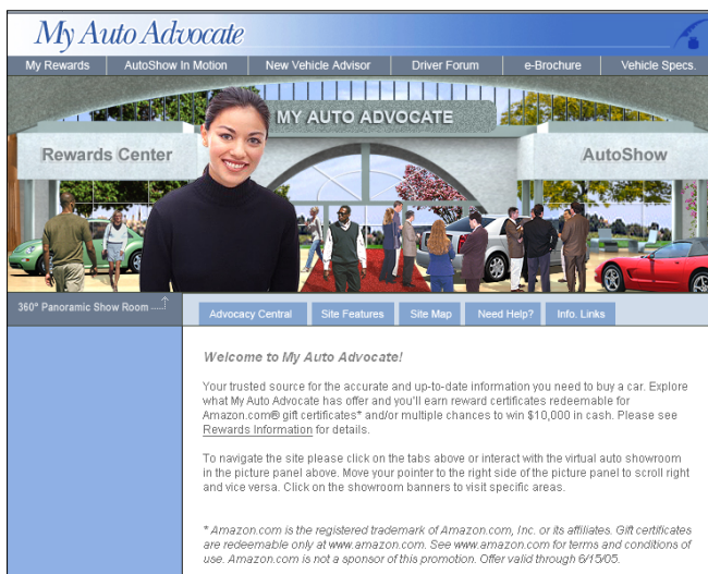
(a) My Auto Advocate Homepage