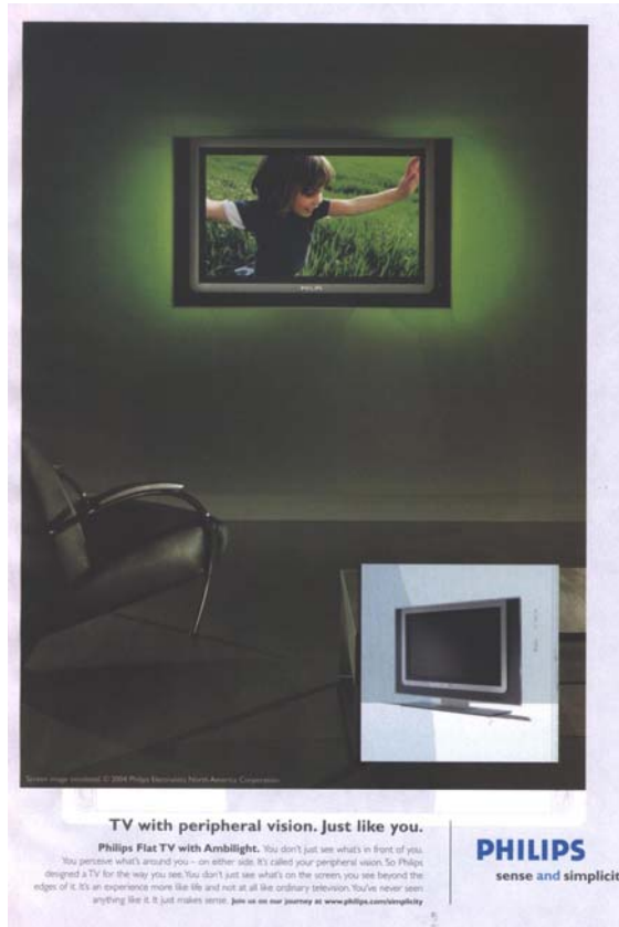
Figure 4. Memory Schema Matter

part, because of Tylenol's long history of "detailing" to doctors who, in turn, recommended Tylenol to their patients.) These and other marketing activities built new memory schema, or resurrected existing positive schema. Consumers' memories were so overwhelmed with the new schema that the poisoning incident became less salient.