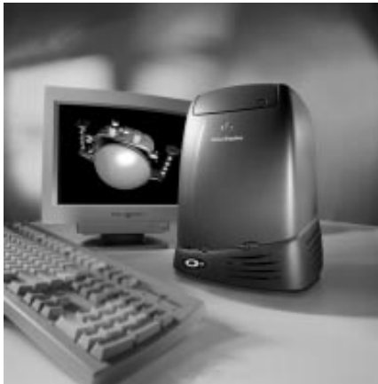
Screen image of underwater camera.

The O2 ships with a new version of the company's UNIX-based operating system, IRIX 6.3, which is backward compatible. O2s also come bundled with Netscape Navigator 3.0, Netscape