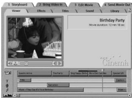
The Avid Cinema interface when in Edit Movie mode.