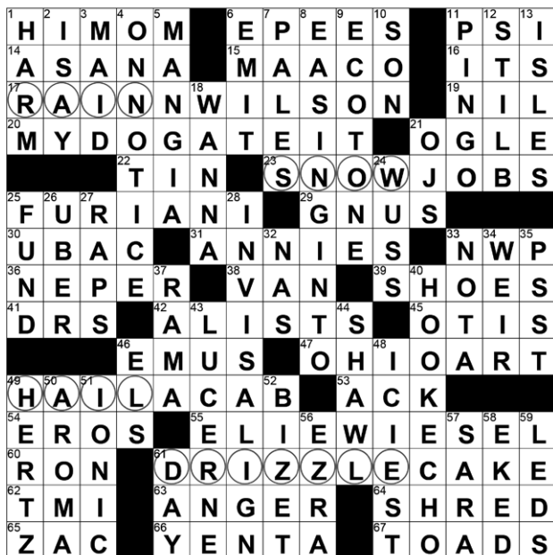
Answers to the puzzle on page 808.