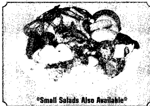
*Small Salads Also Available*