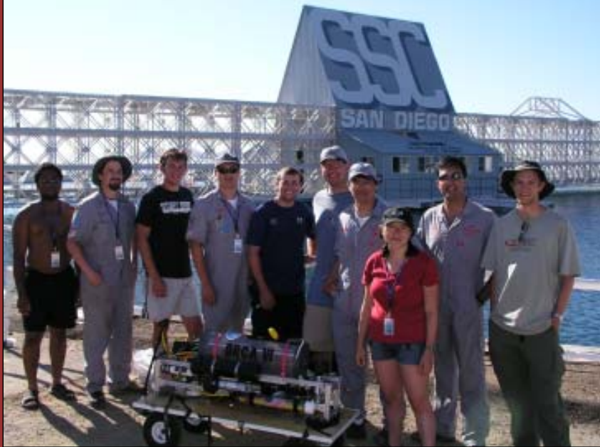
The team at the 2003 A.U.V.S.I Competition in San Diego, California