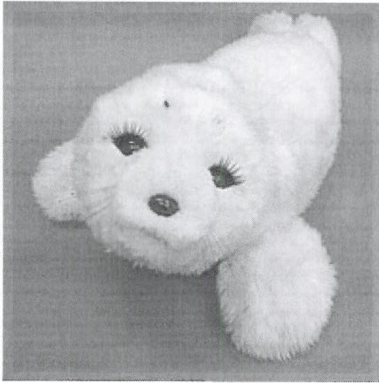
Fig. 1. Paro, the robot used in our work.

nursing home's experience with My Real Baby. In the nursing homes that we visited the elderly would often be gathered in the same room, but there would be little social interaction occurring among members of the group. Thus we wanted to explore the Paro as an impetus to conversation and interaction in a group.